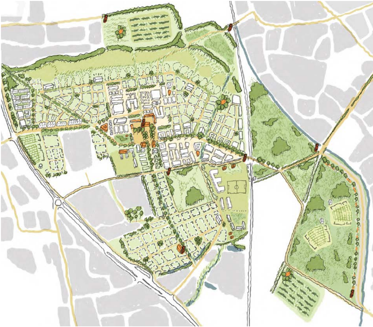
Figure 4.1: 2022 Scheme – Illustrative Layout

4.3.15 The illustrative masterplan included multi-functional environmental and social design solutions designed to enhance the sustainability of the proposed development. This included minimising traditional ‘grey’ infrastructure, with sustainable surface water management strategies integrated into the landscaping, biodiversity and climate resilience measures. Development density was optimised to make the development more accessible to walking and cycling, reducing reliance on vehicle trips and leading to carbon savings. Uses were site to maximise accessibility, through a centralised local centre, public parks, and school sites. Sensitive receptors (e.g. schools, residential uses) were located away from primary transport corridors to minimise exposure to pollution sources whilst ensuring connectivity.