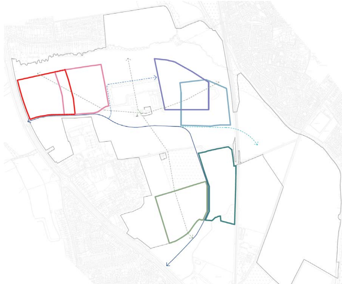
Figure 4.4: Alternative Secondary School Locations

The proposed location for the secondary school shown in dark green on Figure 4.4), between the historical landfill site (to become a new park) and the railway line, was chosen by the Applicant as the best option due to its relationship to the strategic open space and business park, phasing, access linkages and routes,