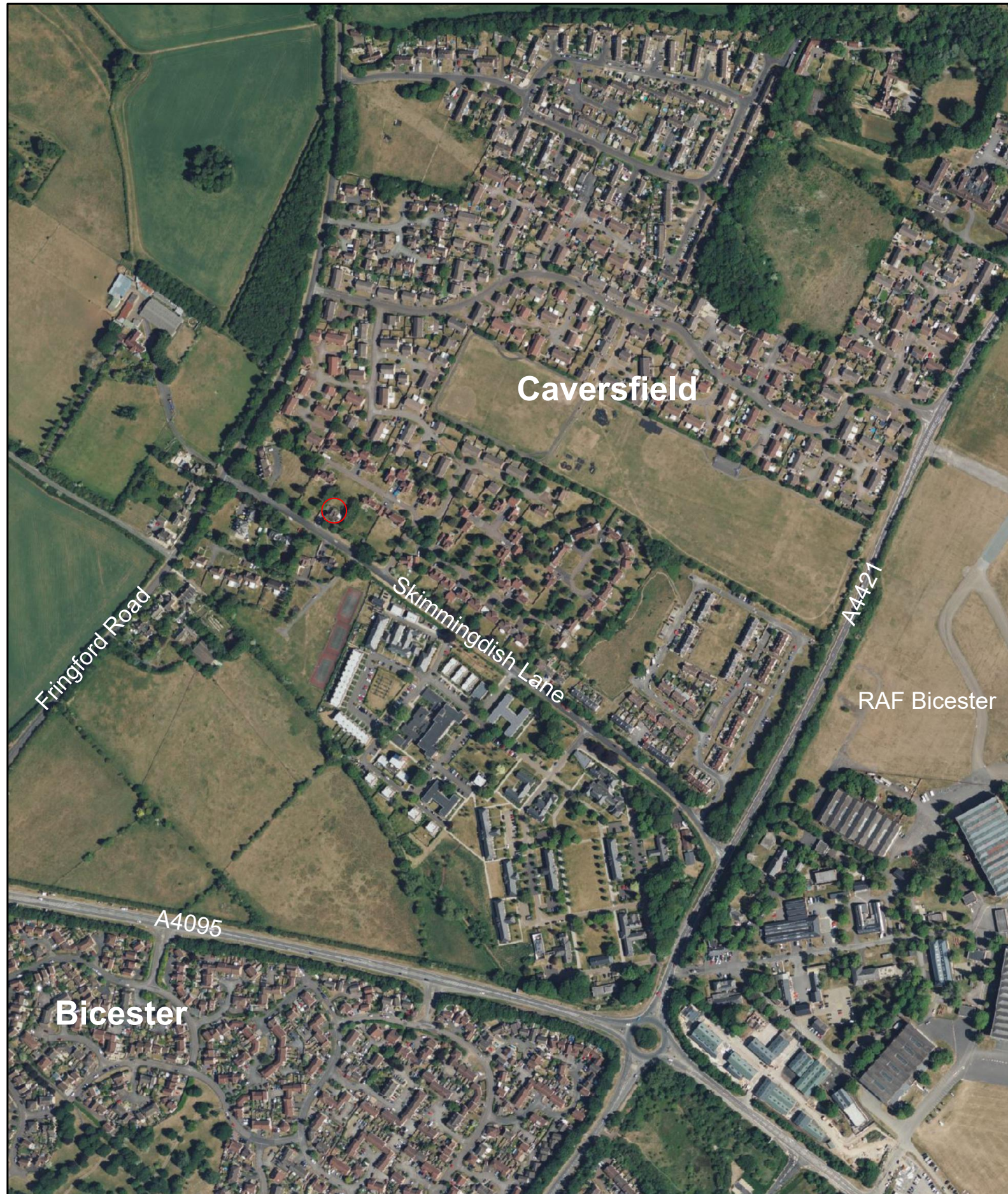
Aerial Site View