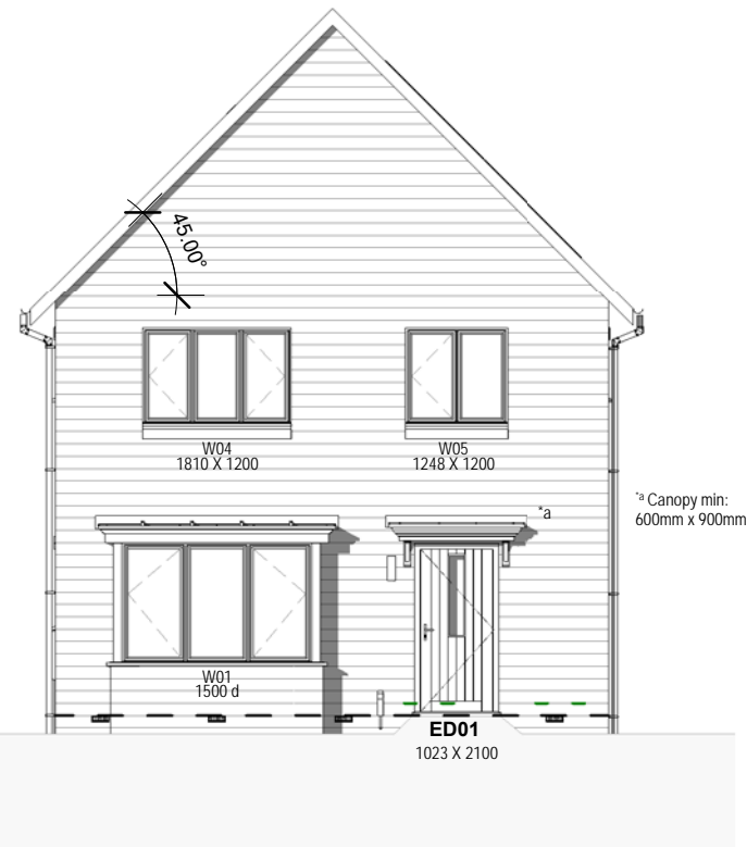
Front Elevation Stone 1 : 100