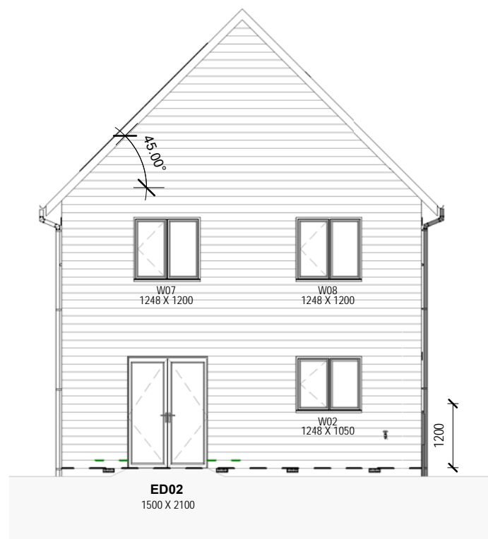
Rear Elevation Stone 1 : 100