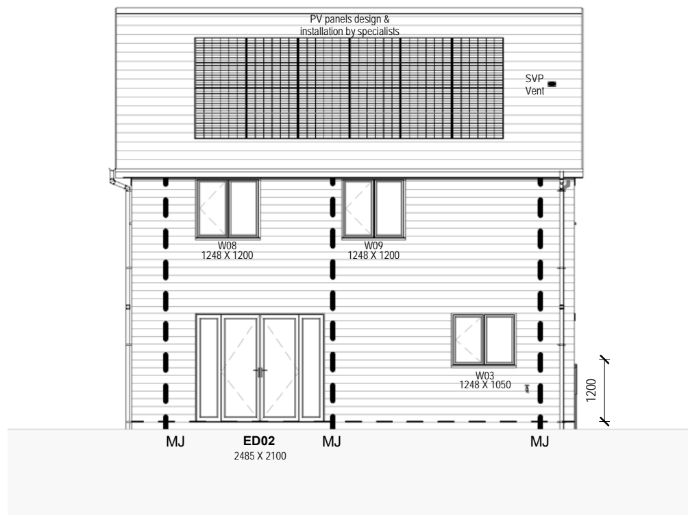
Rear Elevation Stone 1: 100