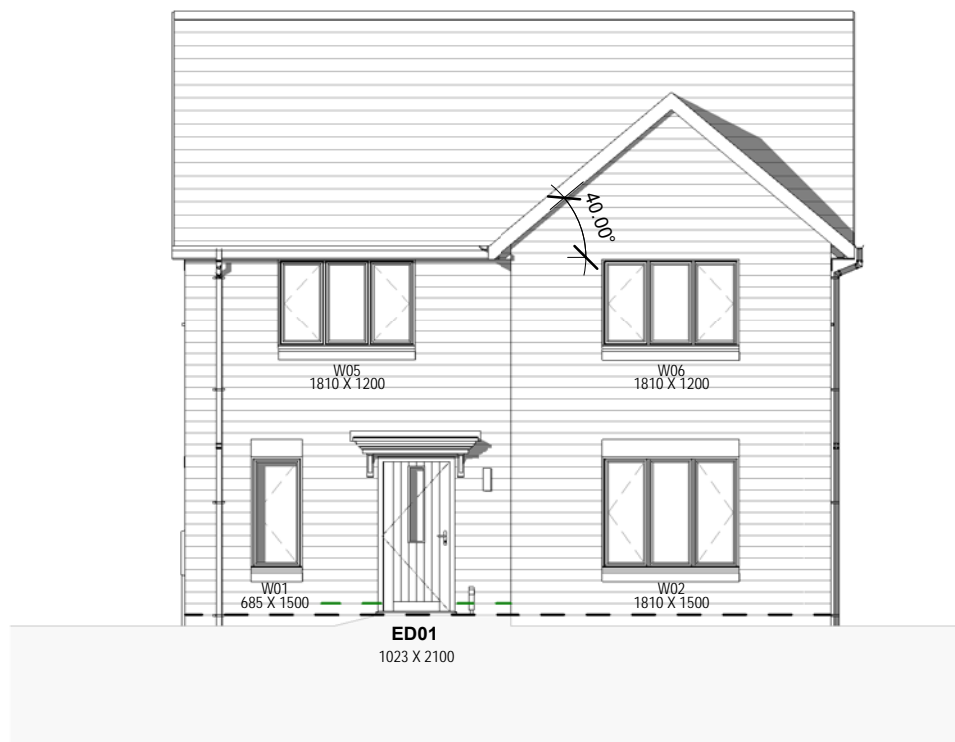
Front Elevation Stone 1: 100