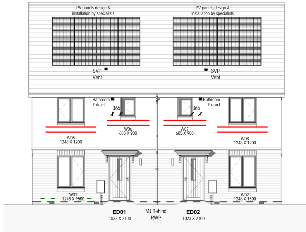
Front Elevation 1: 100