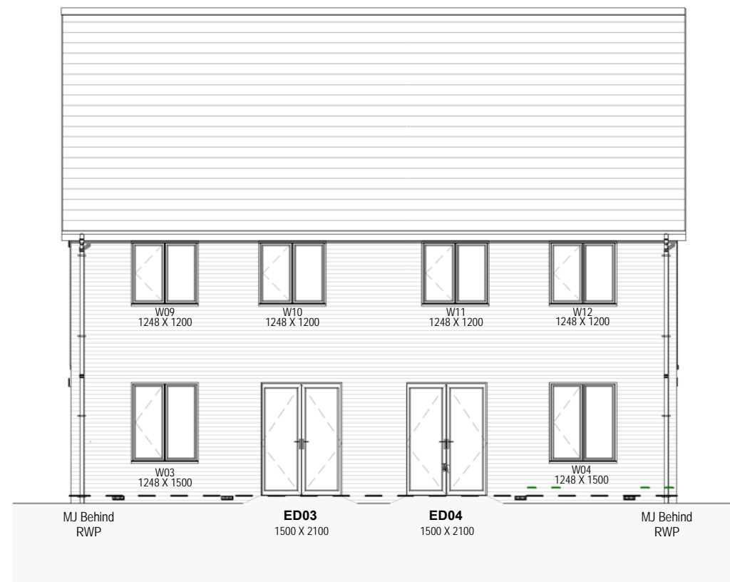
Rear Elevation 1: 100