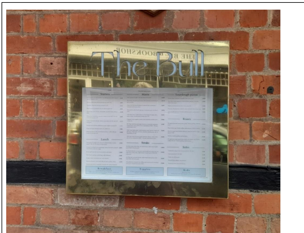
identical menu box (but with different name) at the Bull on Bell Street PH Henley on Thames Oxon.

NEW (not yet installed (to left of front door)