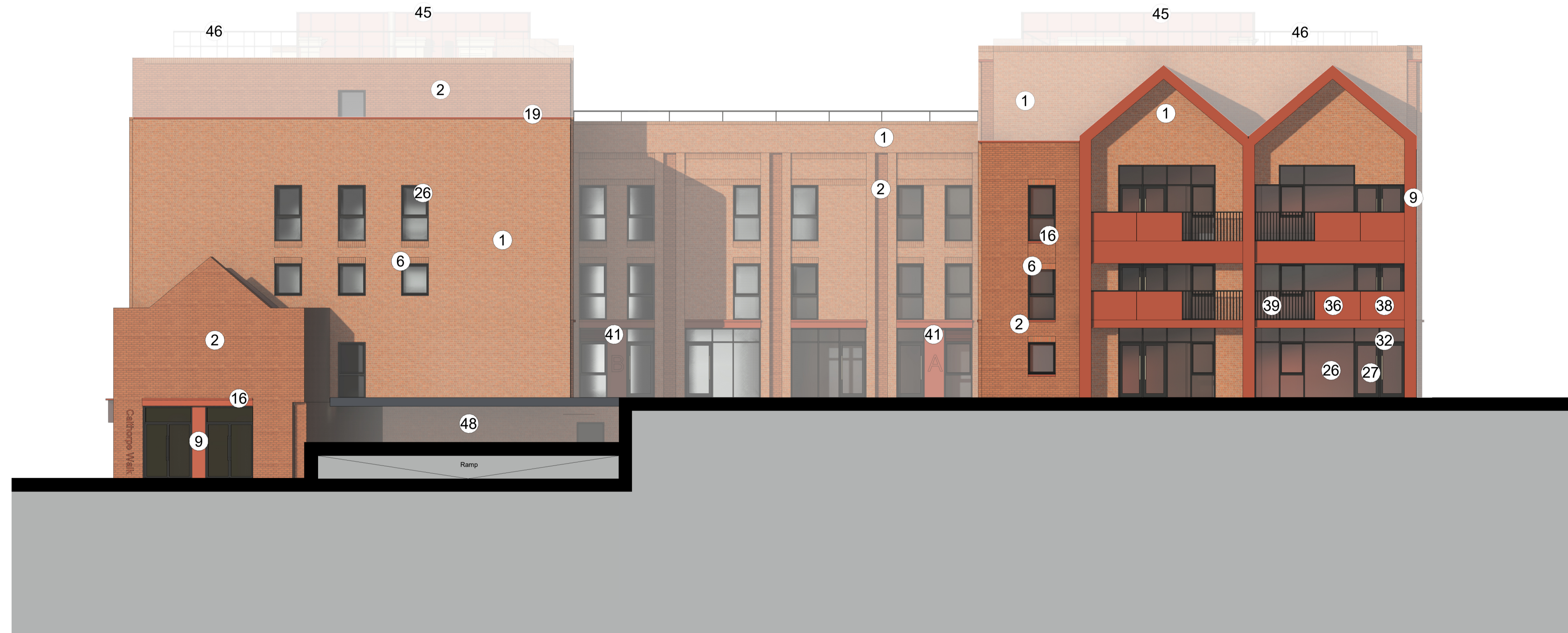
1 Block A-B - West Elevation 1:100