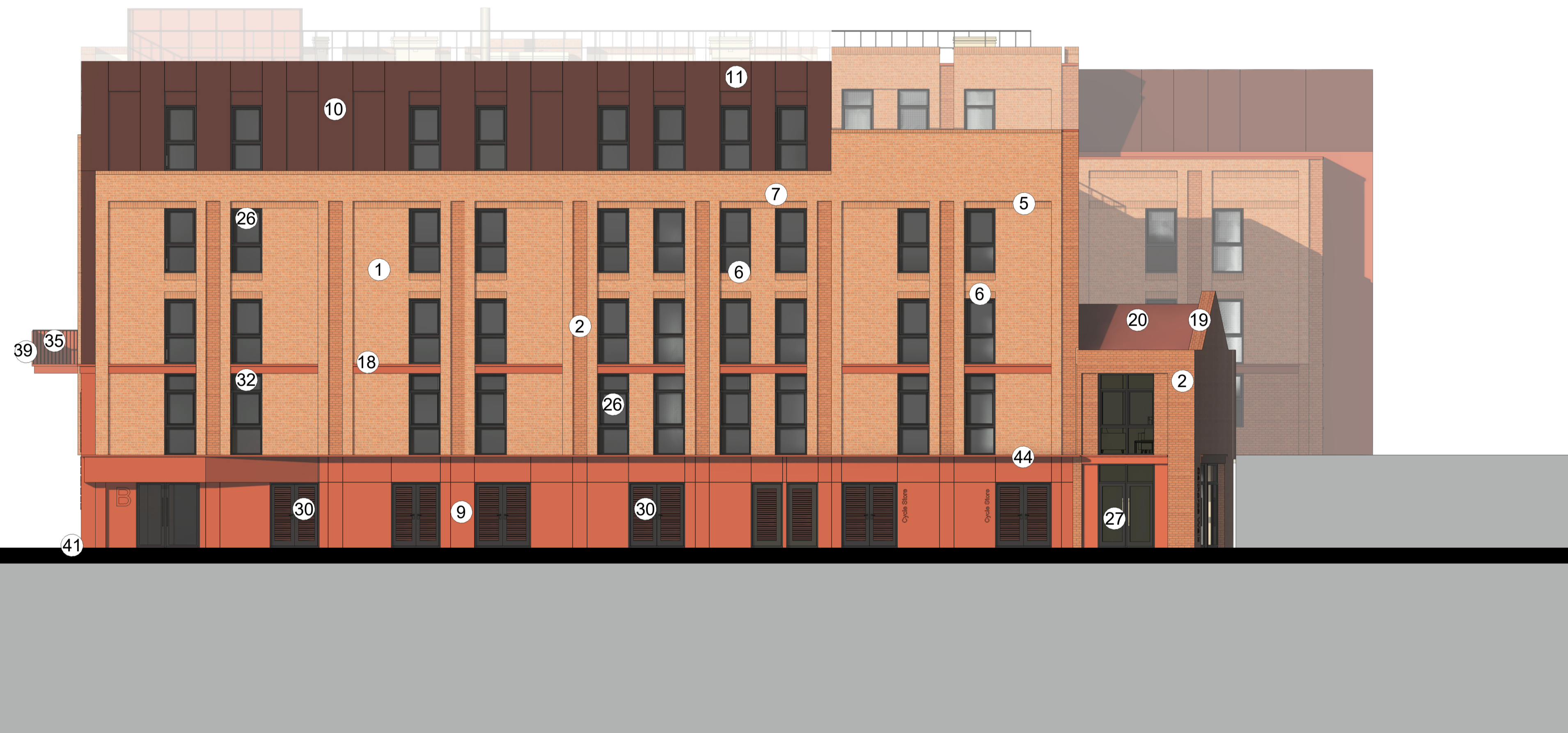
1 Block A-B - North Elevation 1:100