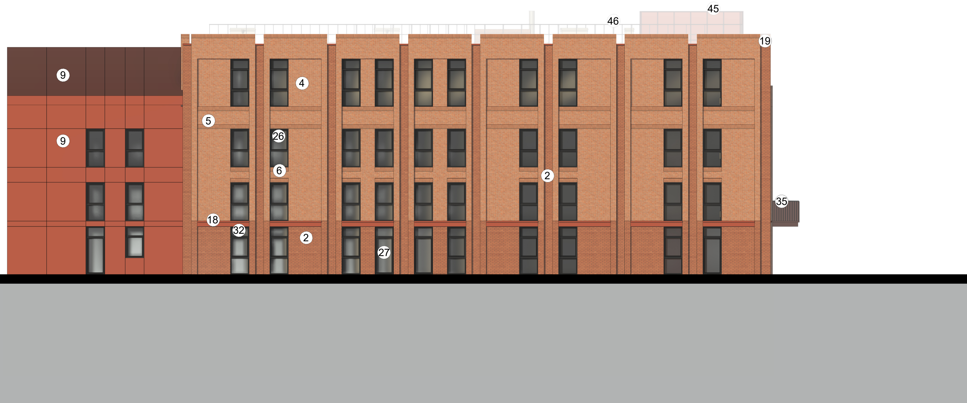
1 Block A-B - South Elevation 1:100