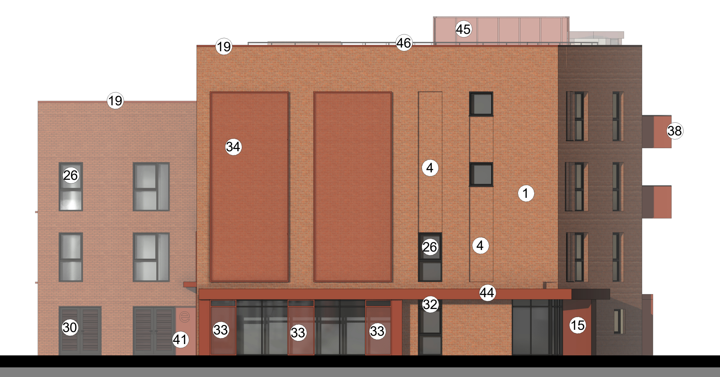
1 South Elevation