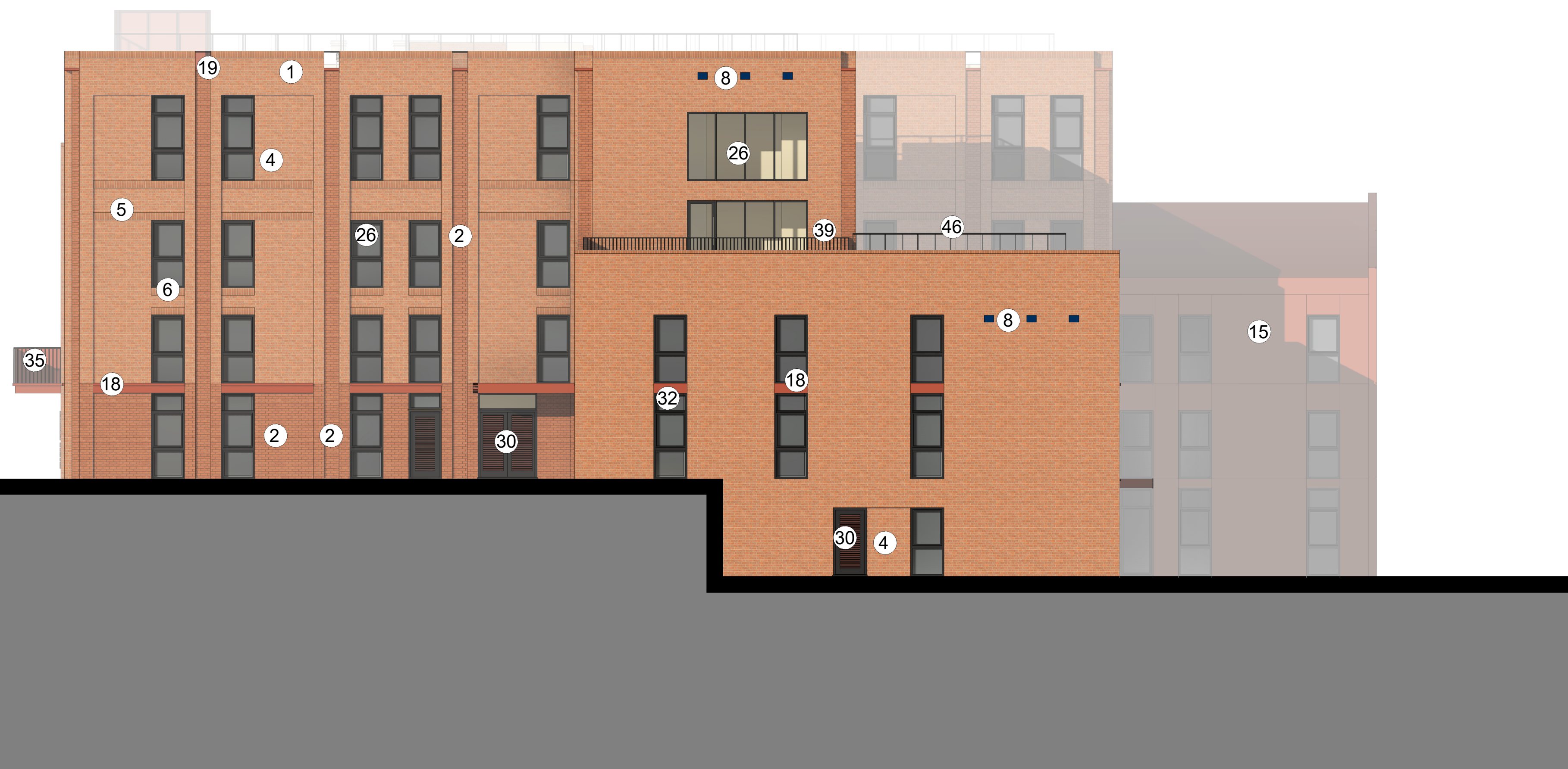
1 Block C-D South Elevation 1 : 100