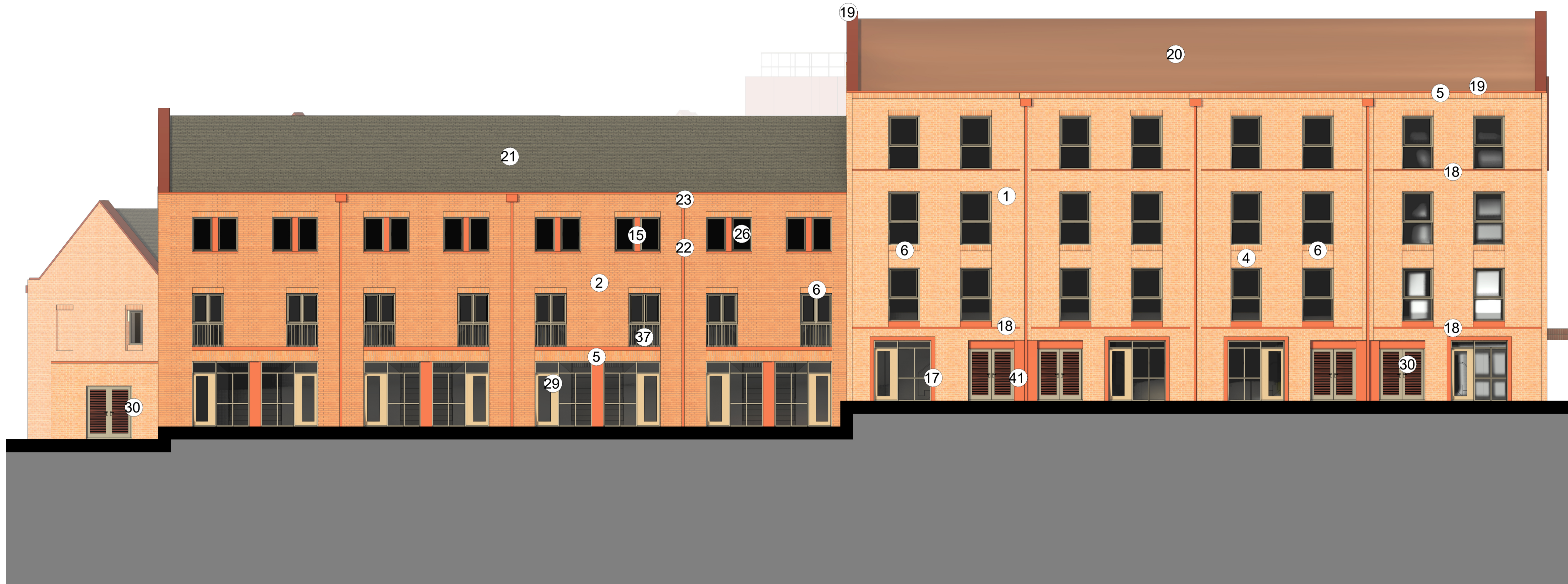
1 West Elevation 1 : 100