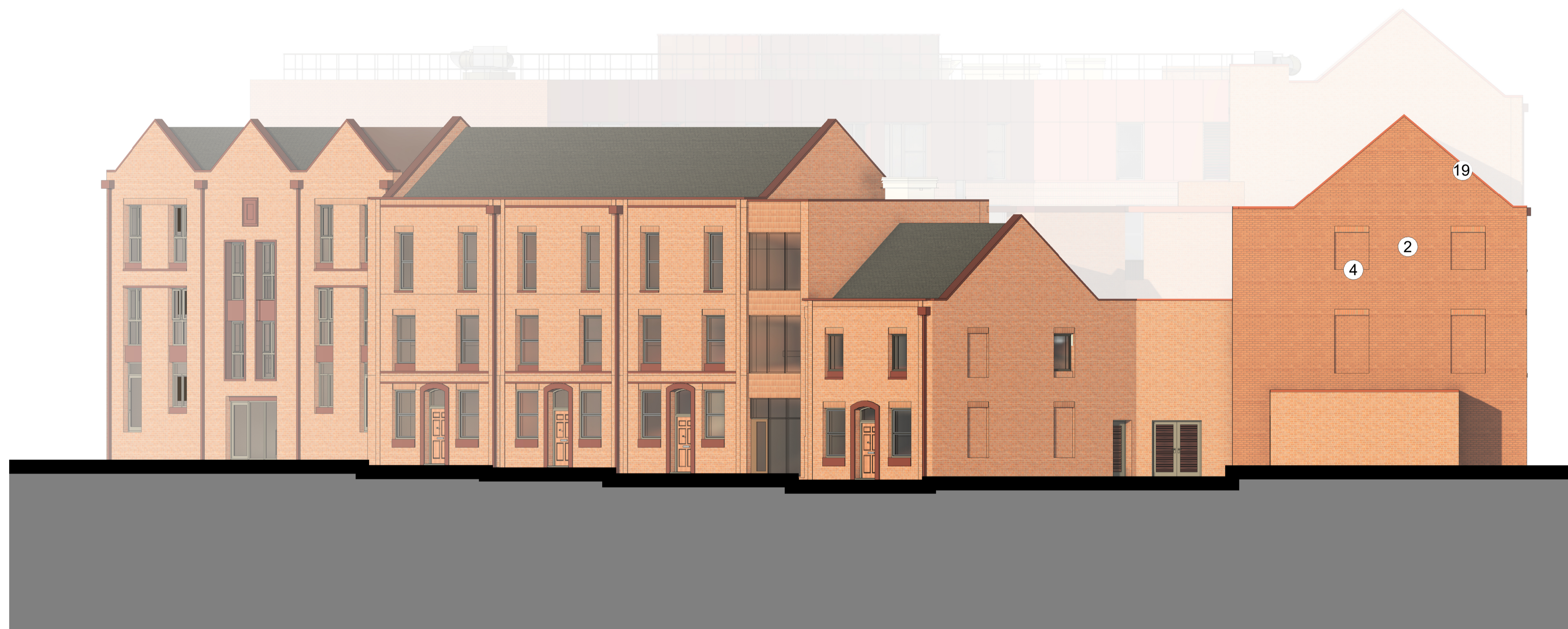
1 North Elevation 1 : 100