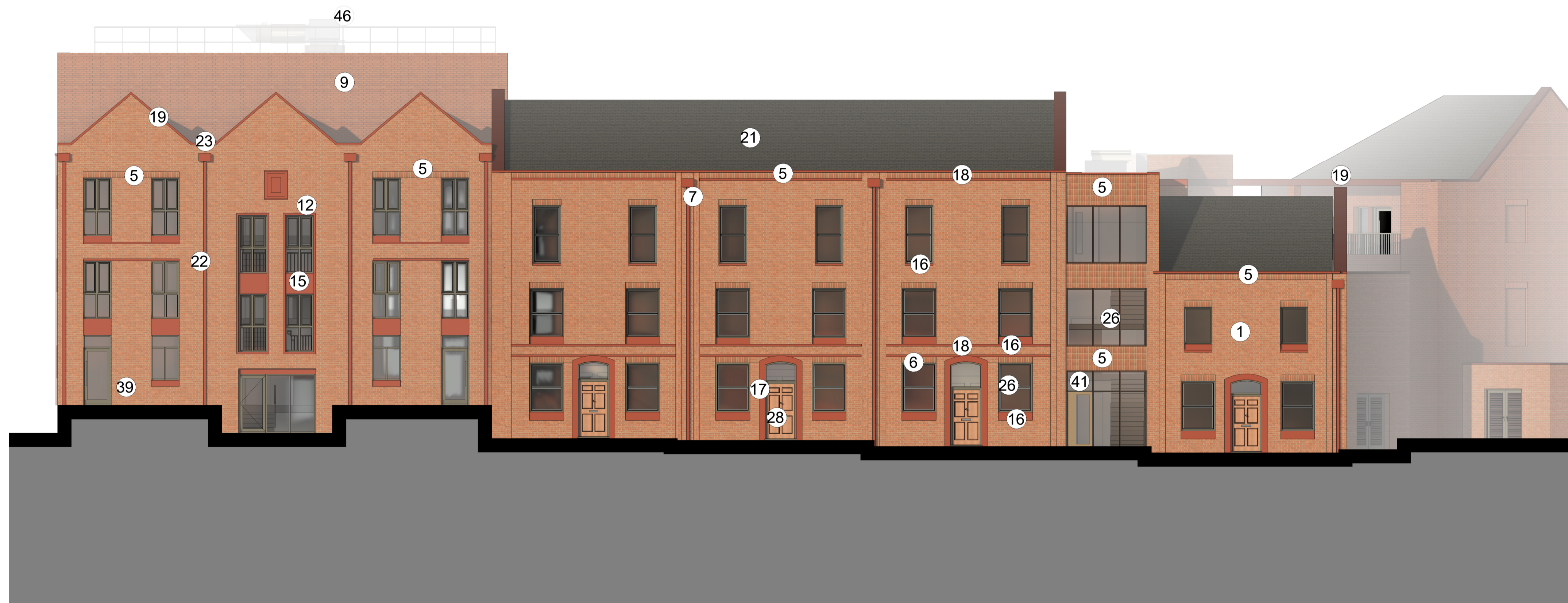
1 North Eastern Elevation 1 : 100