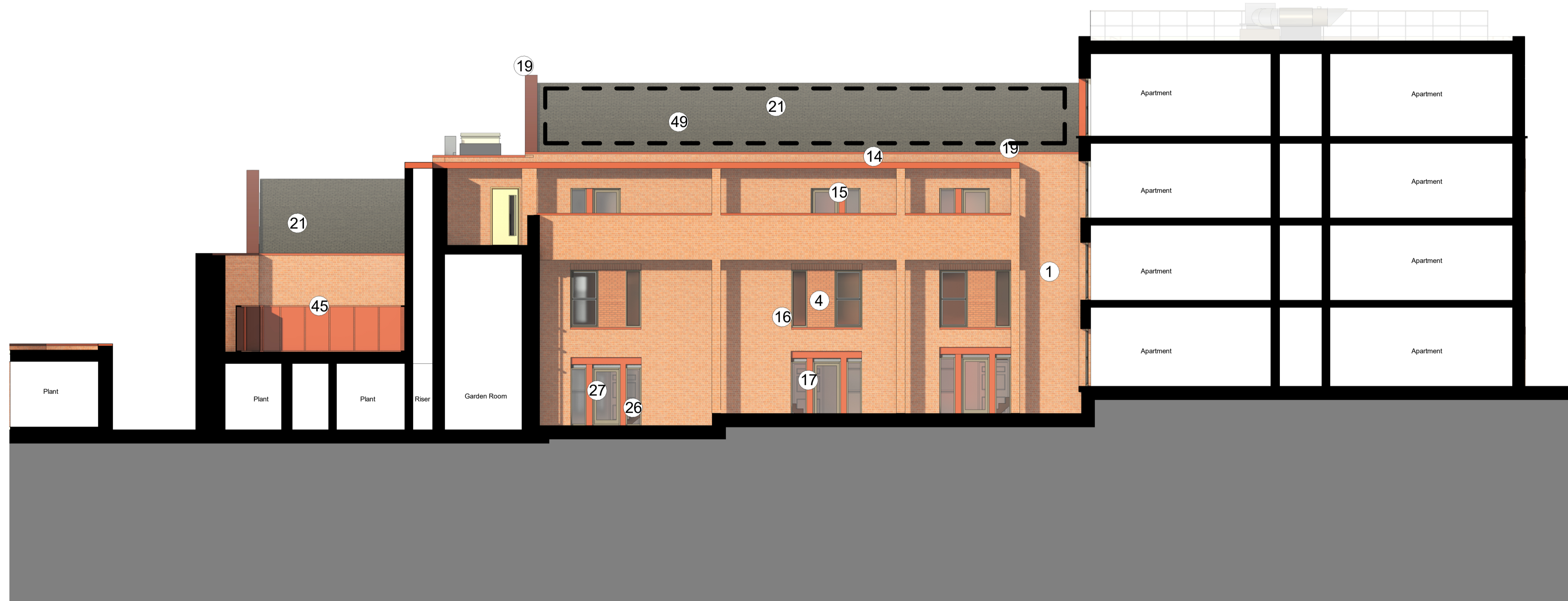
① South Western Elevation 1 : 100