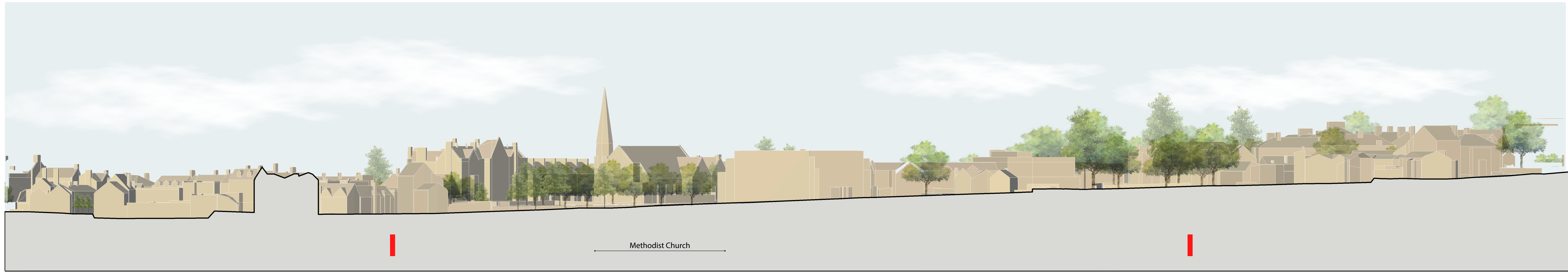
1 Existing Site Section 01 - Calthorpe Street 1 : 500