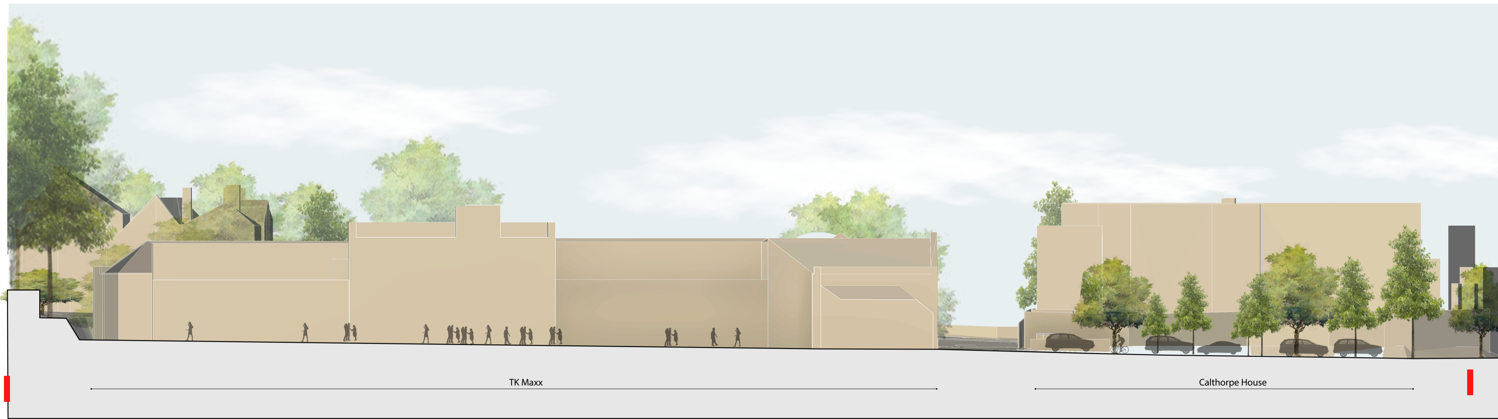
1 Existing Site Section 04 1 : 200