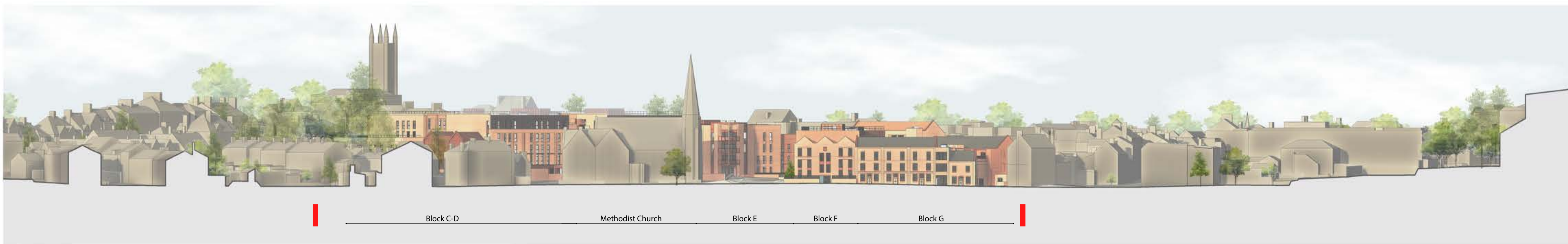
2 Site Section 02 - Marlborough Road 1 : 500