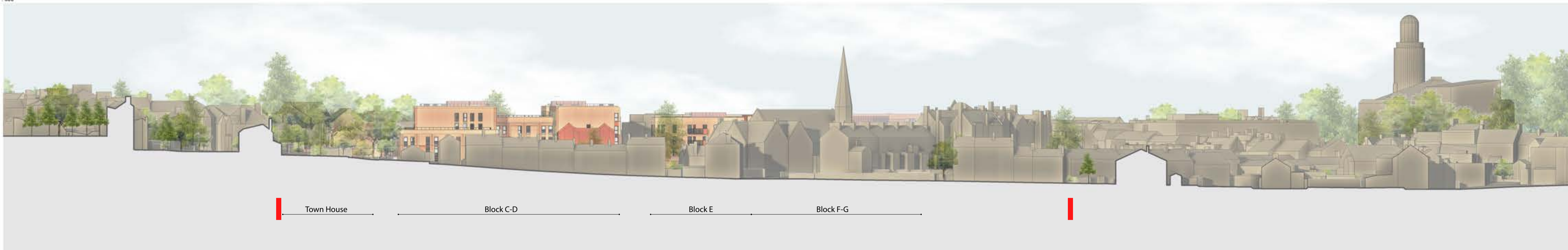
3 Site Section 03 - Marlborough Place 1 : 500