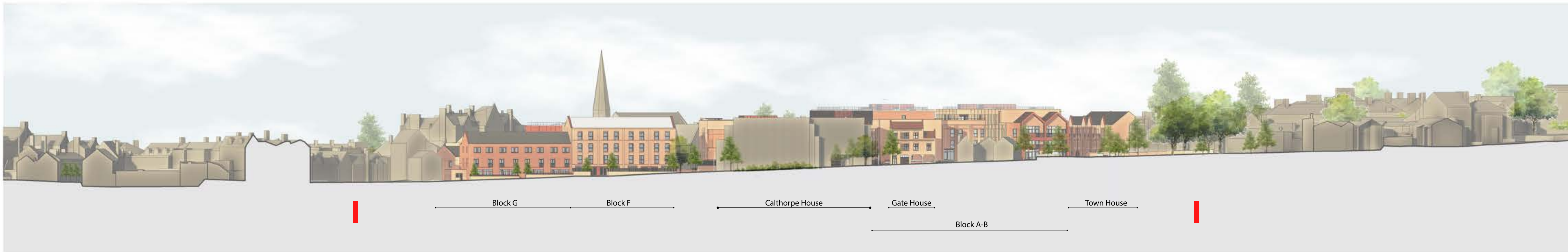
1 Site Section 01 - Calthorpe Street 1 : 500