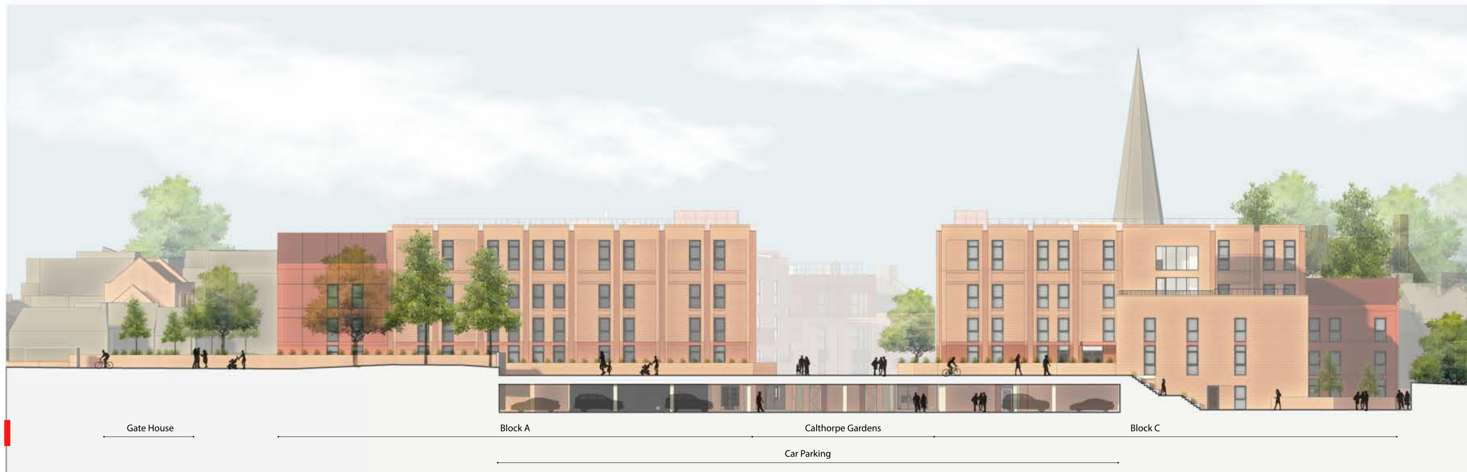
2 Site Section 05 1 : 200