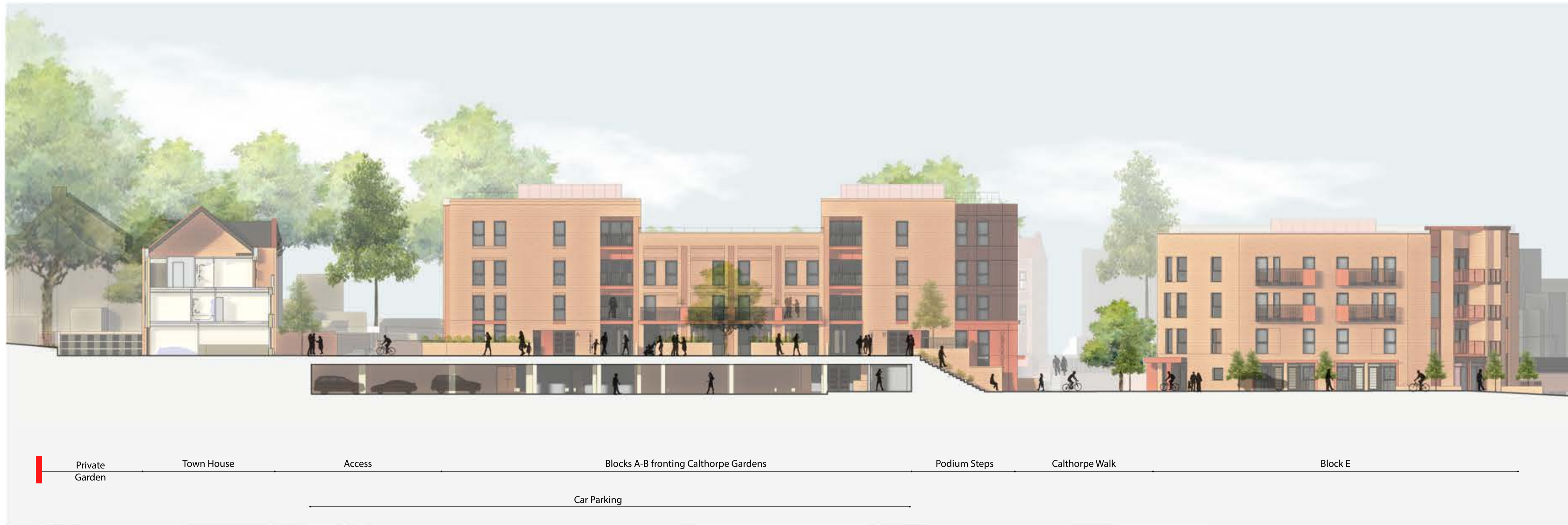
1 Site Section 04 1 : 200