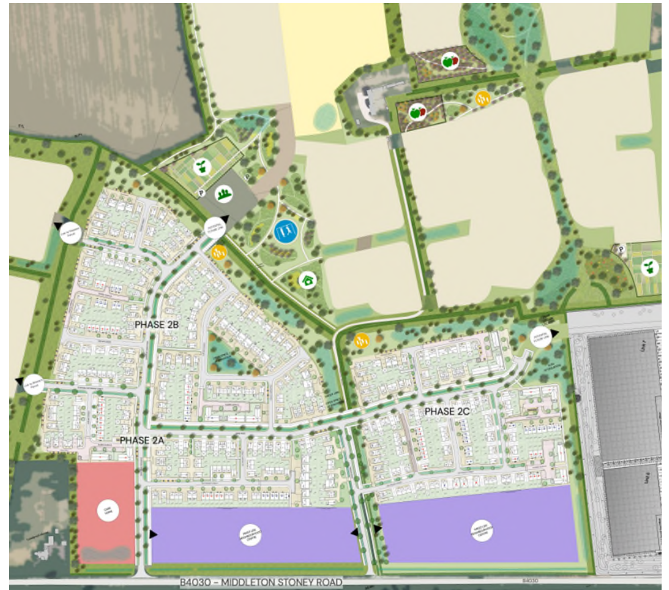
Figure 1 - Himley Village site plan

The site falls within the remit of Cherwell District Council (CDC).