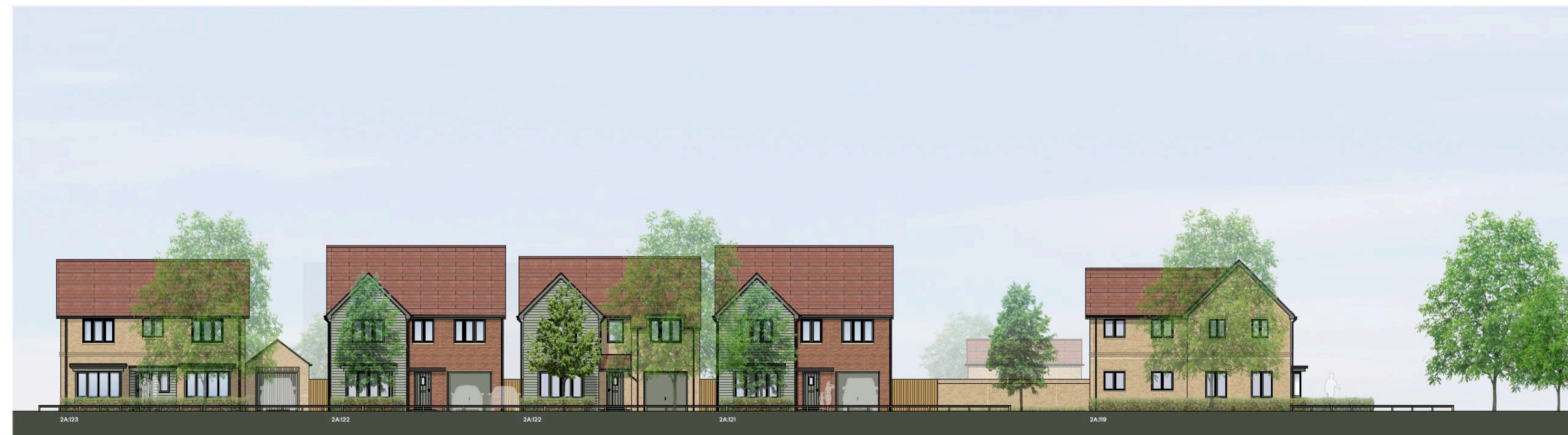
CA2: Green Edge Section CC