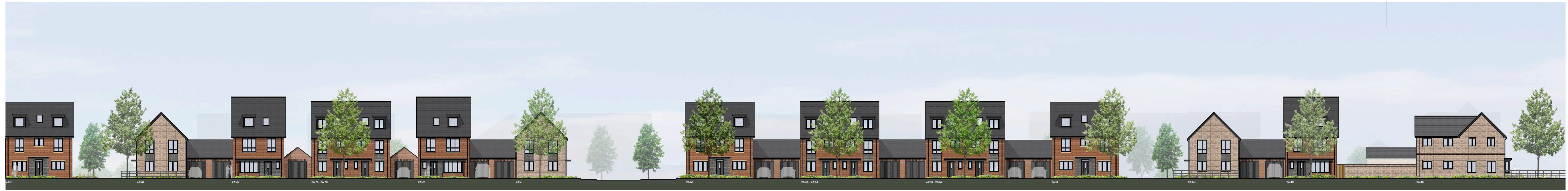
CA1: Spine Road Section AA

Issue: © Pegasus Planning Group Limited. © Crown copyright and database rights OS 100042093. Promap. Licence number 100020449. EnmapSite Licence number 0100031673. Terms & Conditions @ pegasusgroup.co.uk