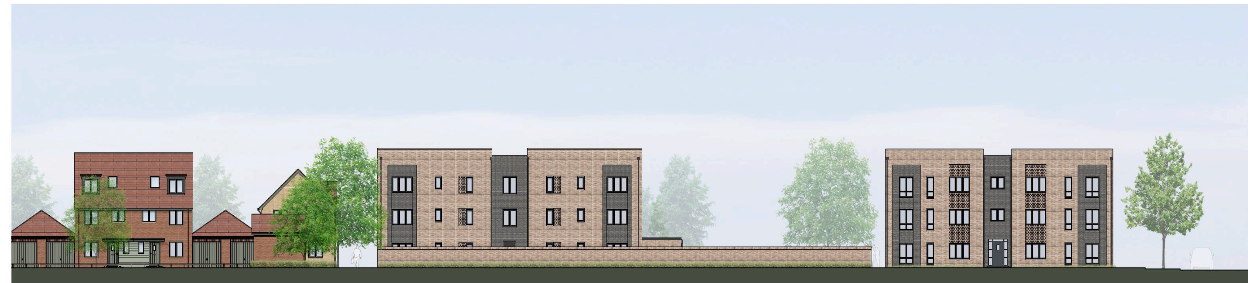
CA2: Green Edge & Spine Road Section DD