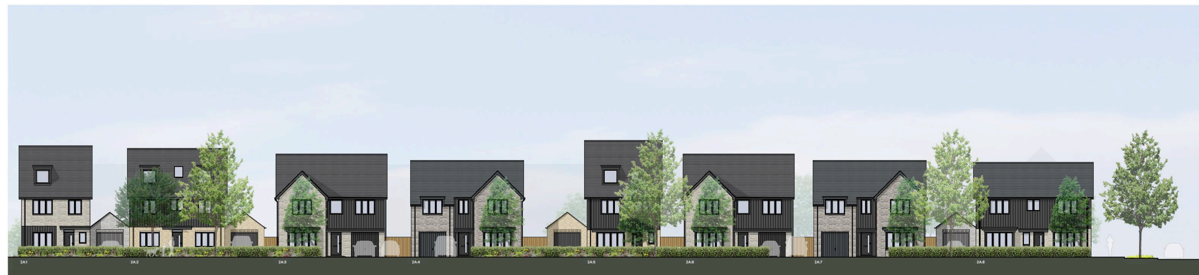
CA4: Central Green Section EE