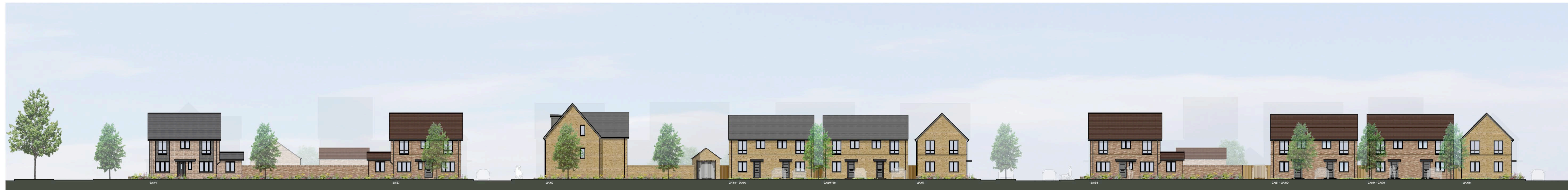
CA3: Core Housing Section BB