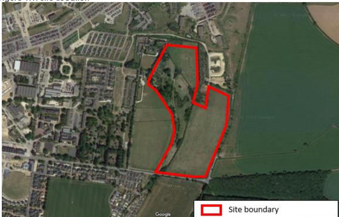
Figure 1.1: Site Location