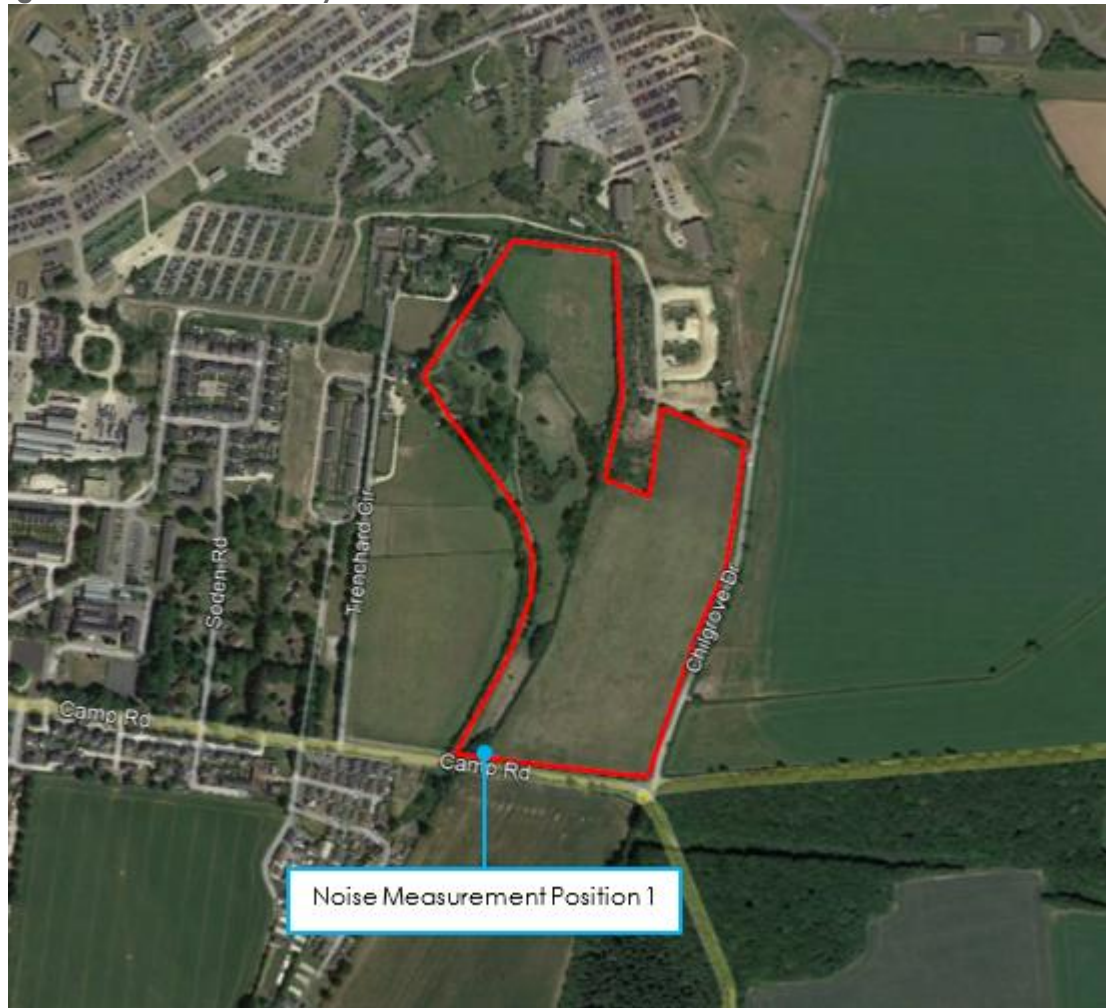
Figure 3.1: Baseline Survey Measurement Location