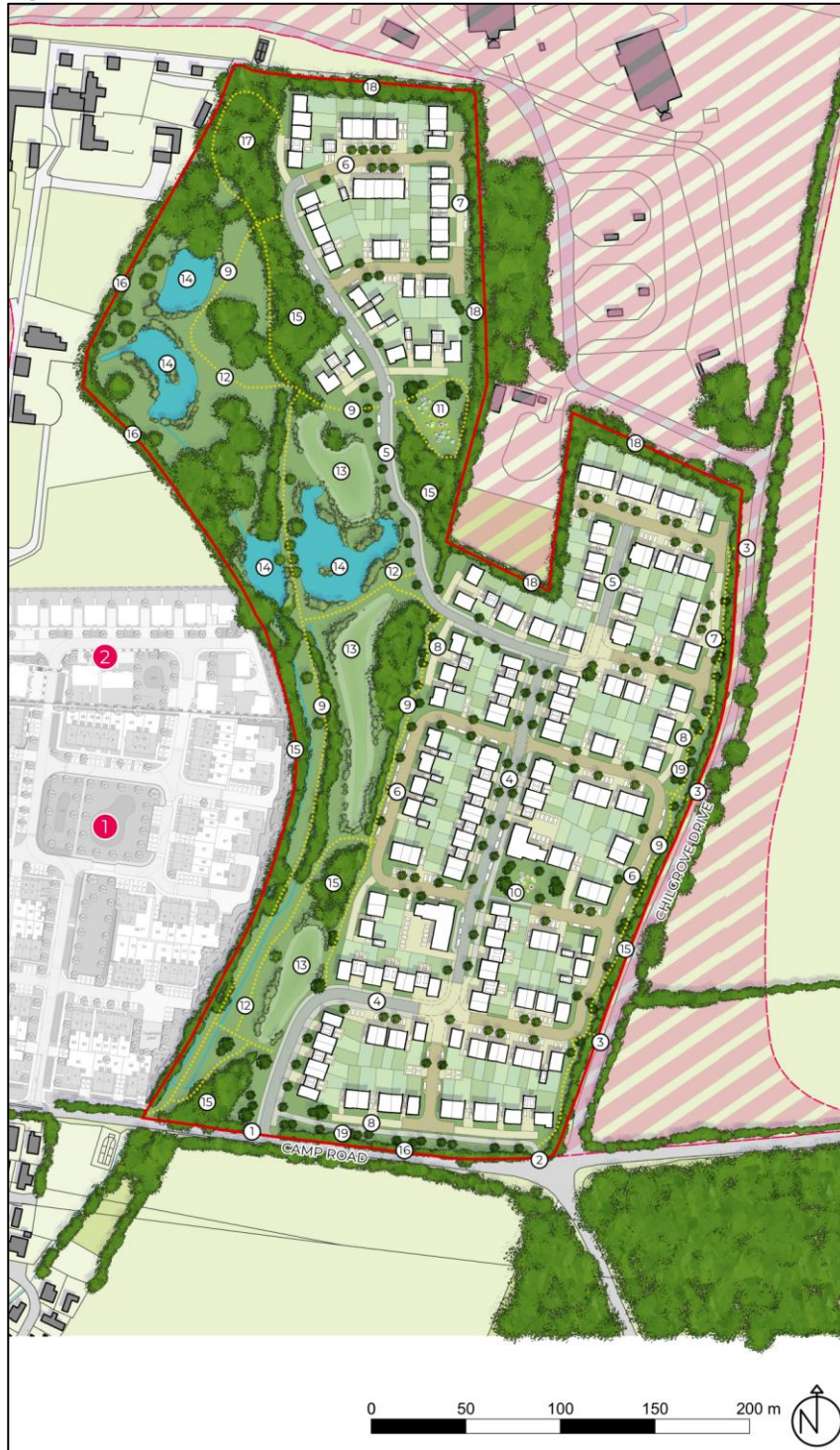
Figure 1.2: Proposed Development Layout