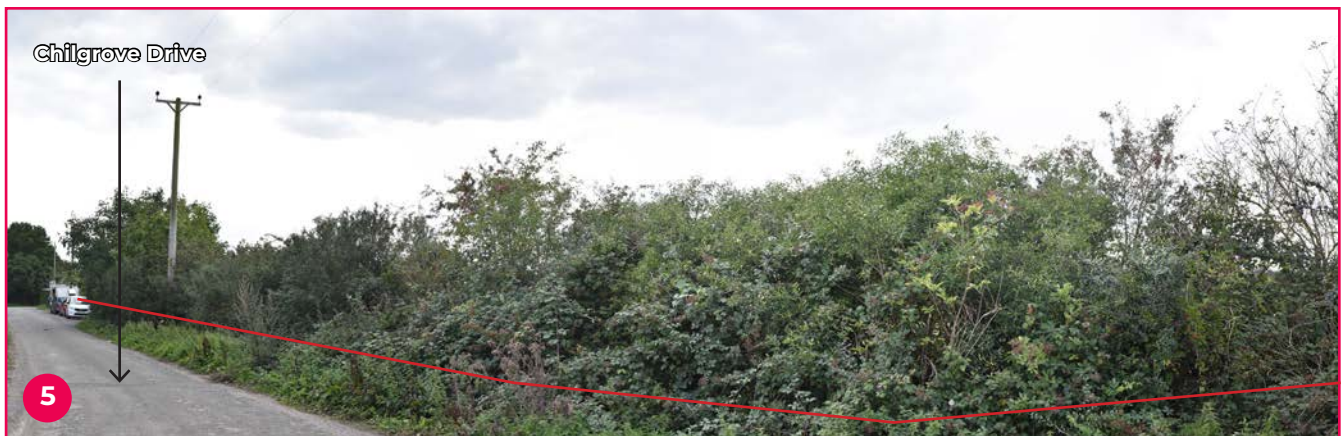
Along Chilgrove Drive