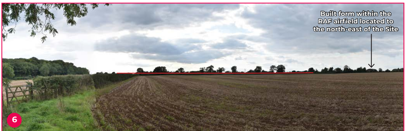
A bridleway located to the east of the Site.