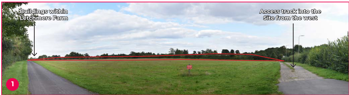
The access track to Letchmere Farm, off Camp Road

The observations from the fieldwork conclude that the site is representative of 'the Upper Heyford Plateau' character, strongly influenced by its context adjacent to Camp Road and the disused airbase. New built form within this area is not uncommon or uncharacteristic.