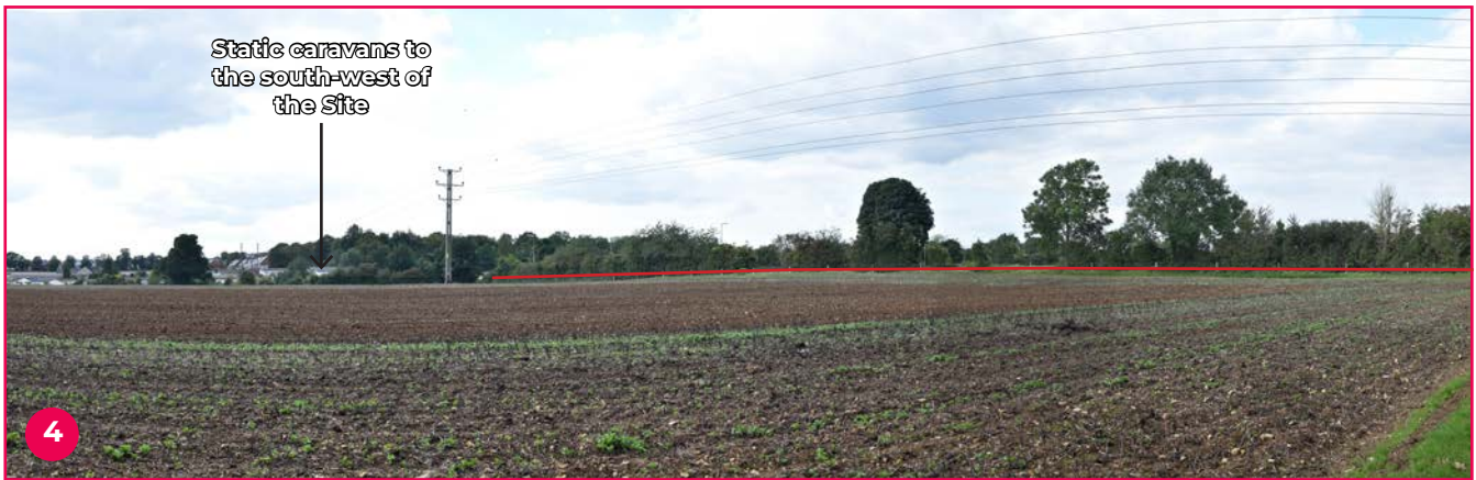
The bridleway located to the south-east of the Site