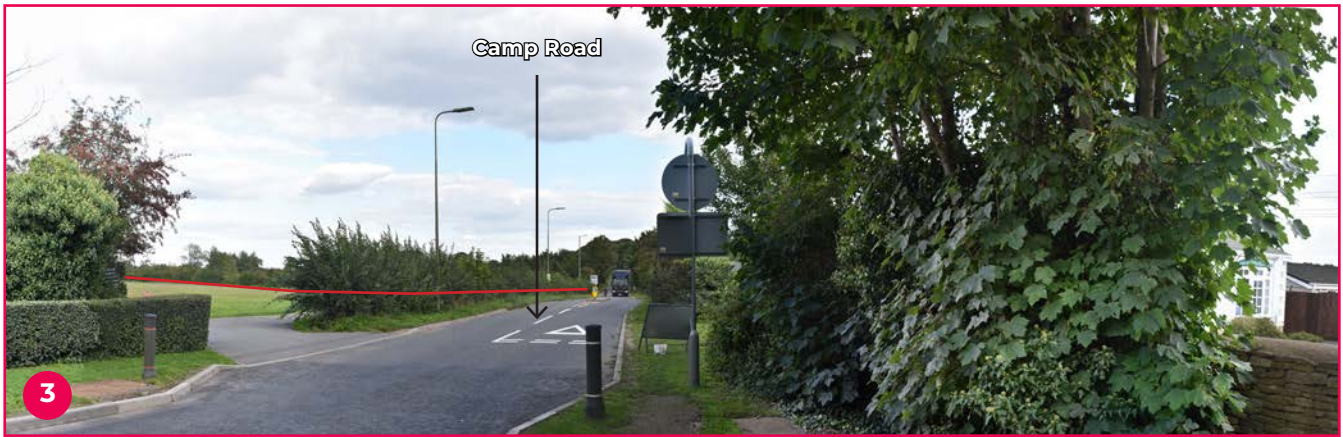
Camp Road, near the Static Caravans located to the south of Camp Road