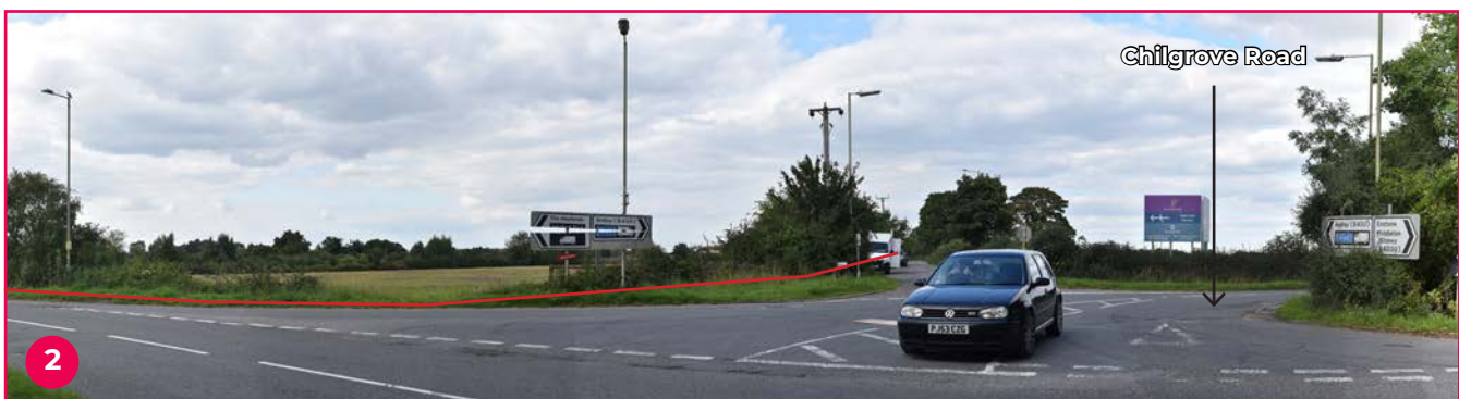
The intersection on the south-eastern corner of the Site