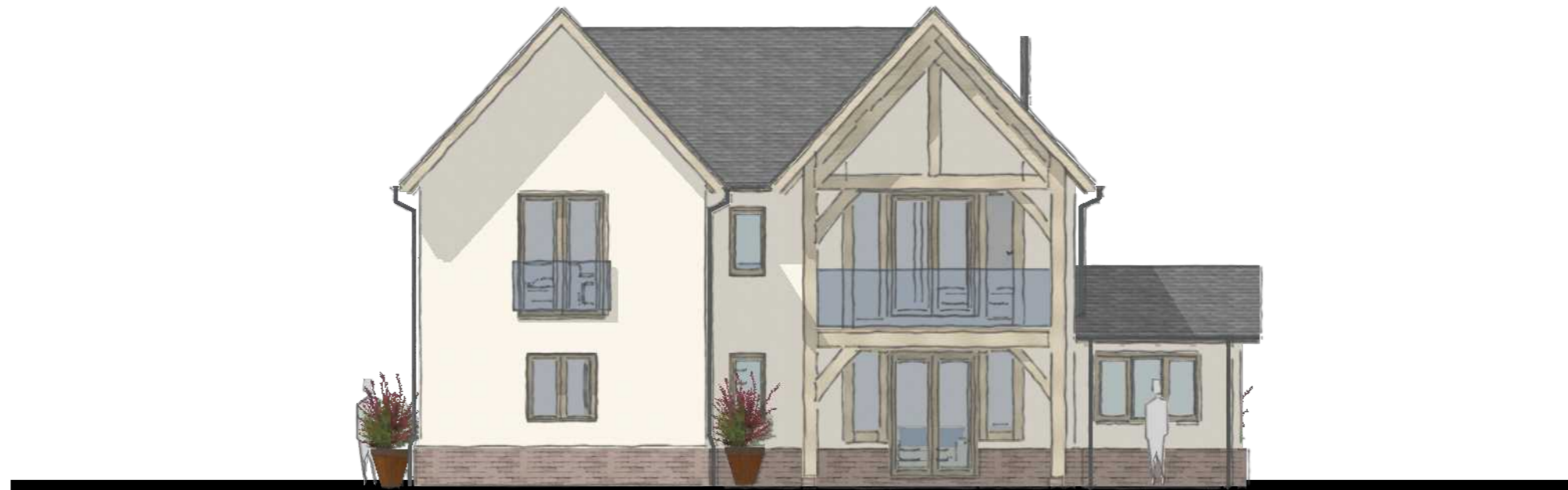
FRONT (SOUTH) ELEVATION Proposed Scale 1:100