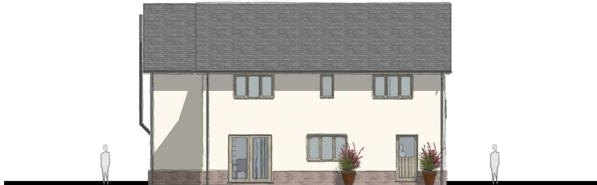
SIDE WEST ELEVATION Proposed Scale 1:100