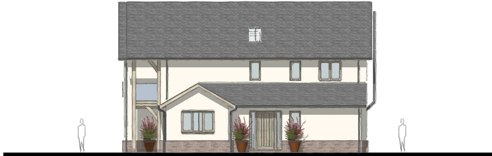
SIDE EAST ELEVATION Proposed Scale 1:100