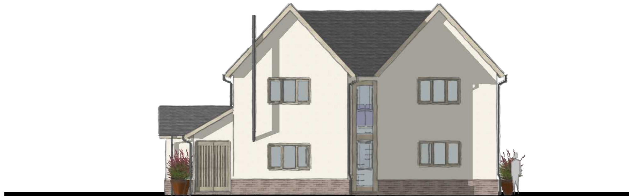
REAR NORTH ELEVATION Proposed Scale 1:100