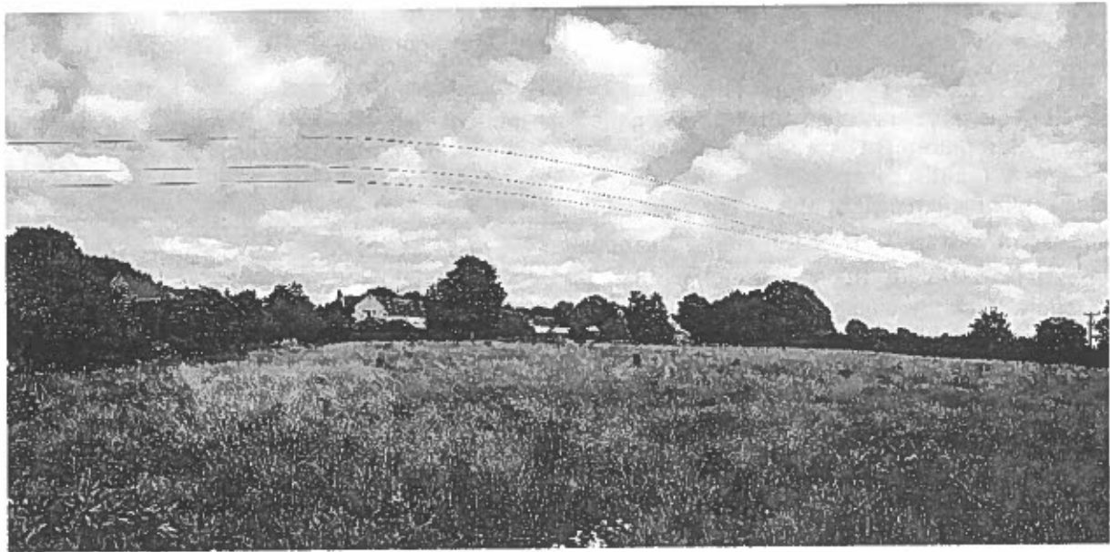
Figure 2 – View of Site from Woodway Road

The current proposal has been amended in terms of its design, layout and landscaping, with 5 no. two storey dwellings with garages, driveways, small gardens and an access driveway concentrated in about half of the site, close to existing dwellings on Woodway Road, Hook Norton Road and Stewart's Court.