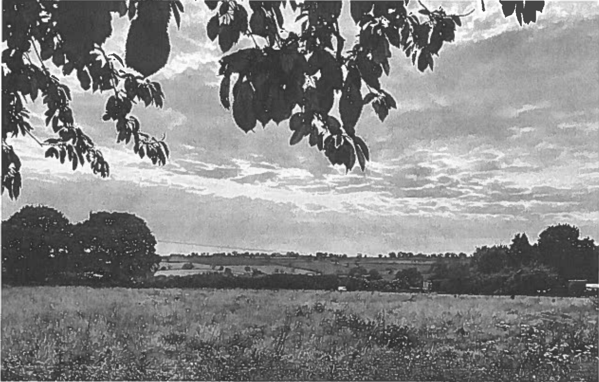
Figure 5 – Existing outlook from garden of Bramley House

The impact of the proposal on existing properties can be gauged from Figure 5, which shows the existing outlook from the garden of Bramley House to the immediate east of the site and will be lost.