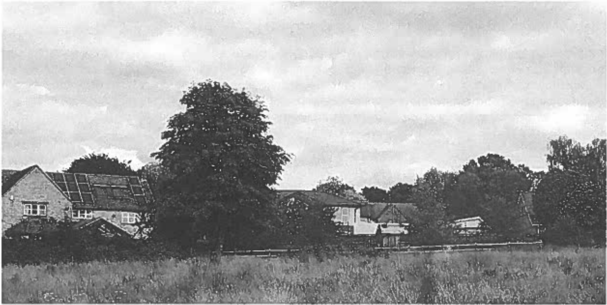
Figure 3 – Existing dwellings and their gardens to the east facing the site

Outlook is important as a dwelling without a reasonable outlook is an undesirable place to live. This is even more important and critical in village locations in rural areas where there is a loose-knit pattern of development and residents have become accustomed to having an open outlook onto fields and the countryside beyond. Whilst the planning system operates in the public interest and does not protect private views, it is not unreasonable for proposed development to respect existing residential amenities, deliver suitable living conditions and maintain an acceptable outlook.