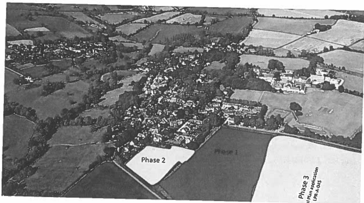
Figure 1 – Pressure for Residential Development in this Locality

The Action Group considers that just because one development has been unfortunately allowed does not mean this latest, amended and harmful proposal should also be approved.