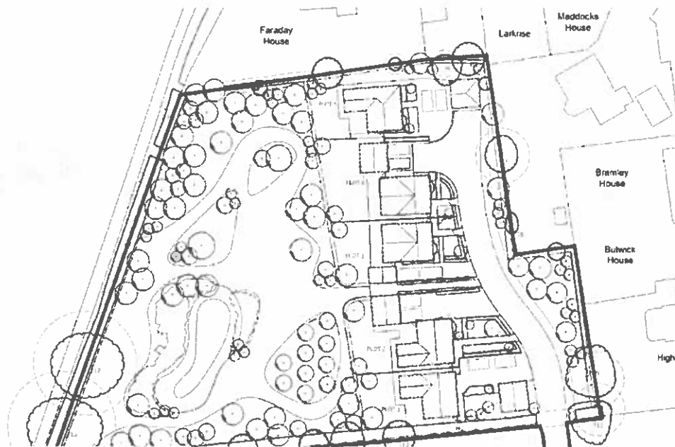
Figure 4 – Proposed Site Plan

The close proximity of the proposal to existing dwellings is evident from Figure 4.