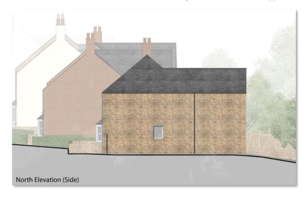
Figure 6 – View of Proposal from the North (Faraday House)

The physical impact of the dwellings – especially Plot 5 – is perhaps most acute upon Faraday House just 15 metres to the north of the site, as shown on Figure 6 taken from the application.