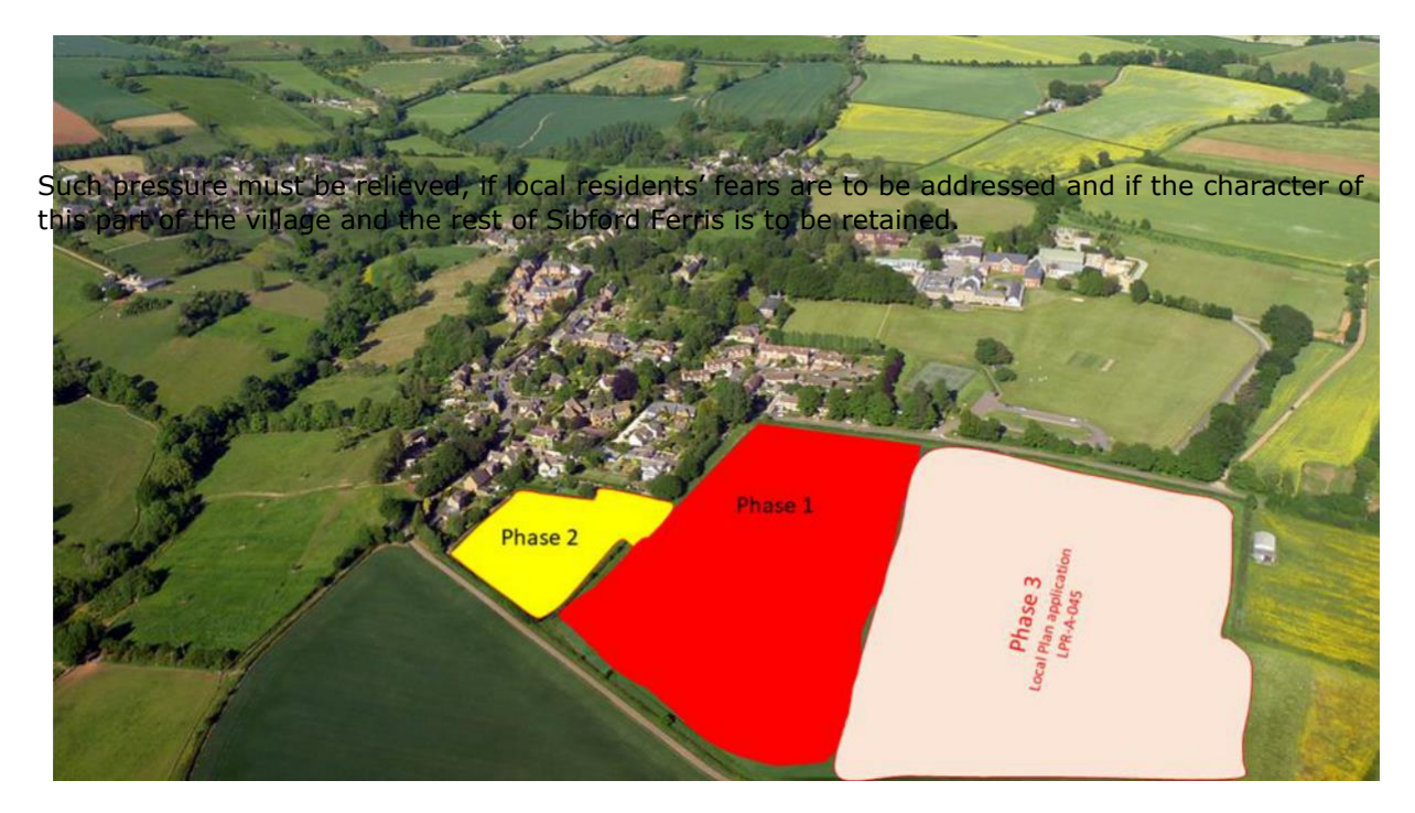
Figure 1 - Pressure for Residential Development in this Locality

The Action Group considers that just because one development has been unfortunately allowed does <u>not</u> mean this latest, amended and harmful proposal should also be approved.