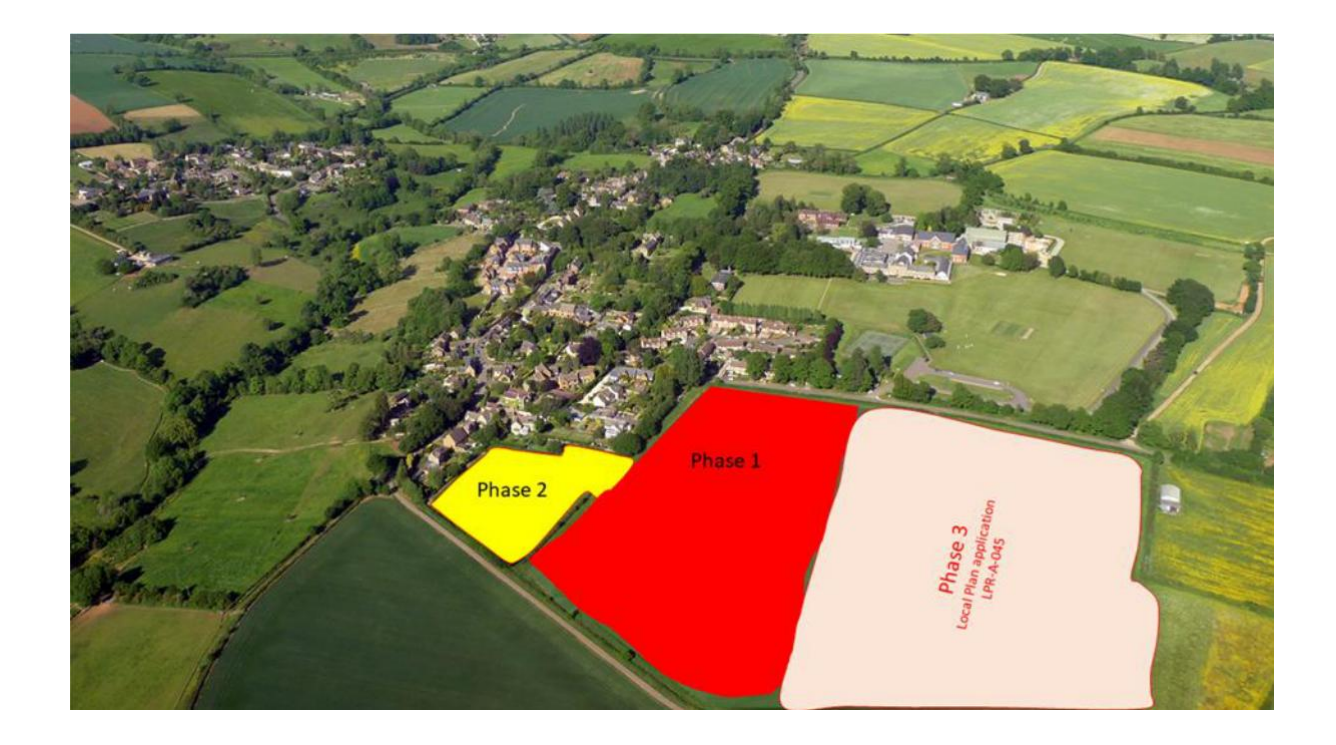
Figure 1 – Pressure for Residential Development in this Locality

The Action Group considers that just because one development has been unfortunately allowed does <u>not</u> mean this latest, amended and harmful proposal should also be approved.