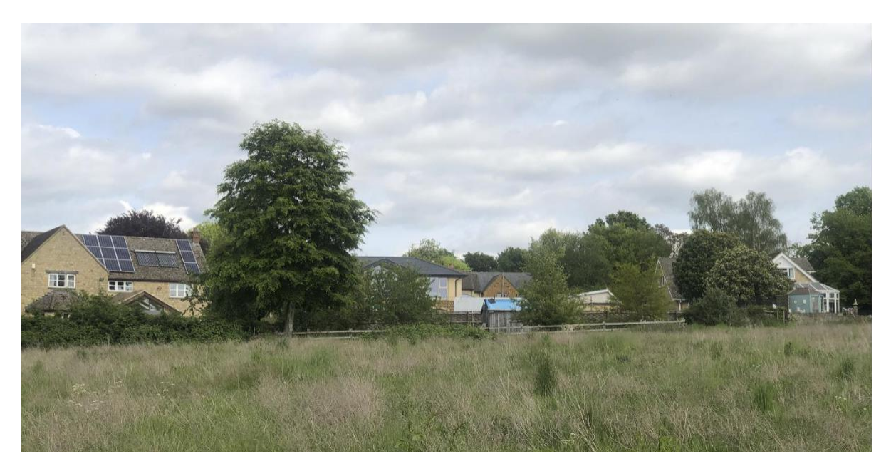
Figure 3 – Existing dwellings and their gardens to the east facing the site

Outlook is important as a dwelling without a reasonable outlook is an undesirable place to live. This is even more important and critical in village locations in rural areas where there is a looseknit pattern of development and residents have become accustomed to having an open outlook onto fields and the countryside beyond. Whilst the planning system operates in the public interest and does not protect private views, it is not unreasonable for proposed development to respect existing residential amenities, deliver suitable living conditions and maintain an acceptable outlook.