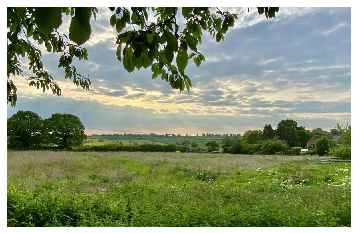
Figure 5 – Existing outlook from garden of Bramley House

The impact of the proposal on existing properties can be gauged from Figure 5, which shows the existing outlook from the garden of Bramley House to the immediate east of the site and will be lost.