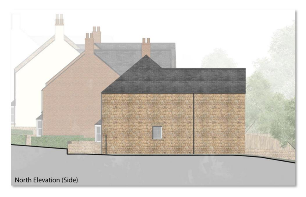
Figure 6 – View of Proposal from the North (Faraday House)

The physical impact of the dwellings – especially Plot 5 – is perhaps most acute upon Faraday House just 15 metres to the north of the site, as shown on Figure 6 taken from the application.