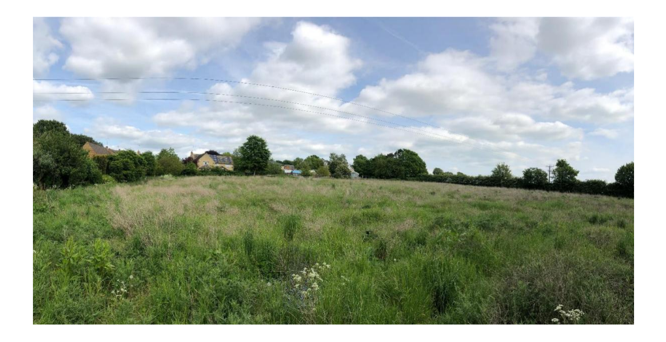
Figure 2 – View of Site from Woodway Road

The current proposal has been amended in terms of its design, layout and landscaping, with 5 no. two storey dwellings with garages, driveways, small gardens and an access driveway concentrated in about half of the site, close to existing dwellings on Woodway Road, Hook Norton Road and Stewart's Court.