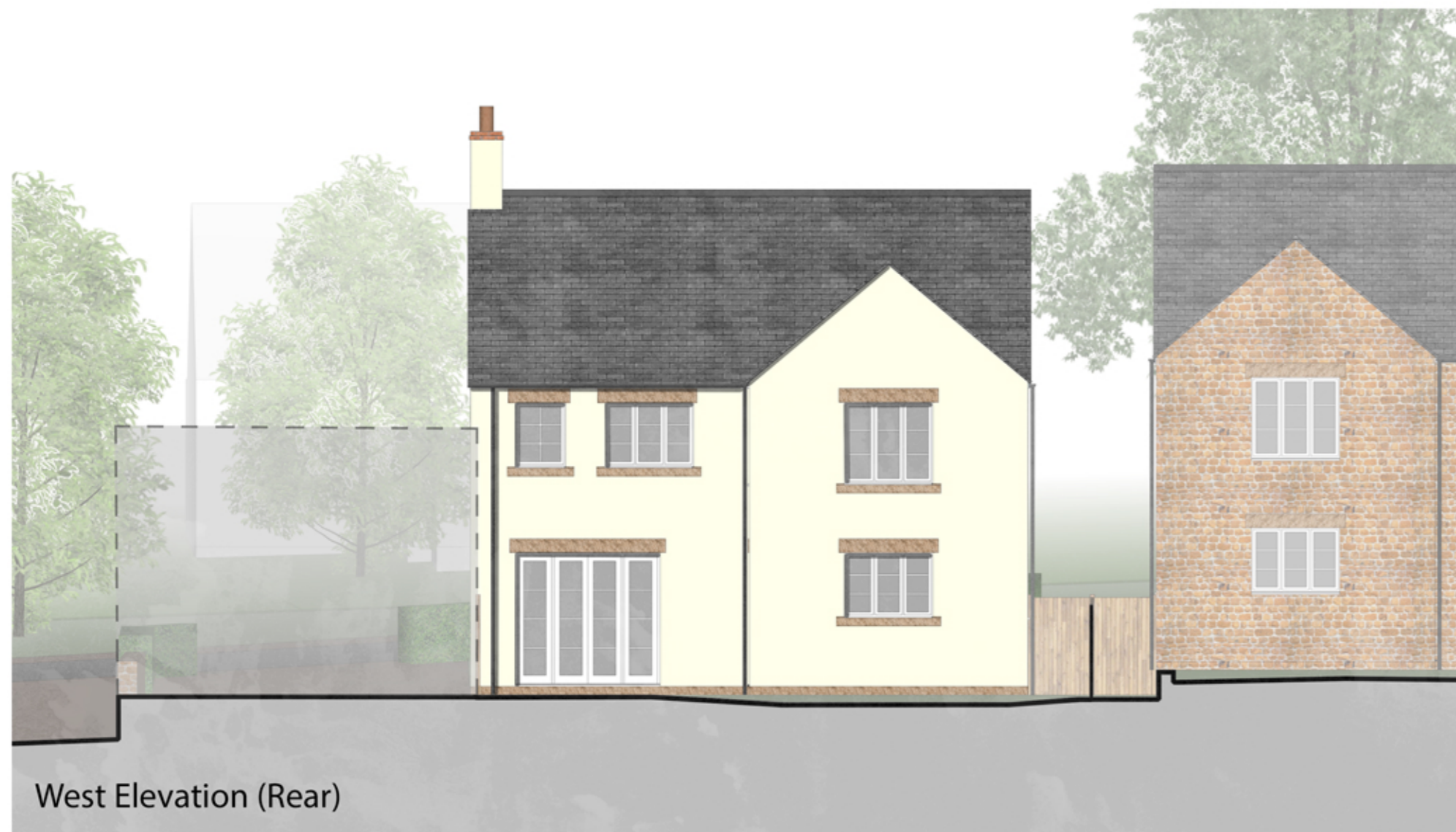
West Elevation (Rear)