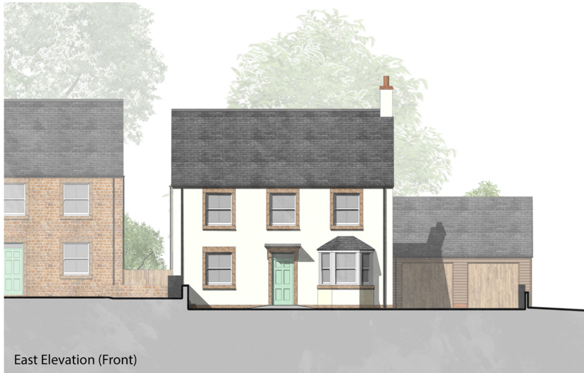
East Elevation (Front)