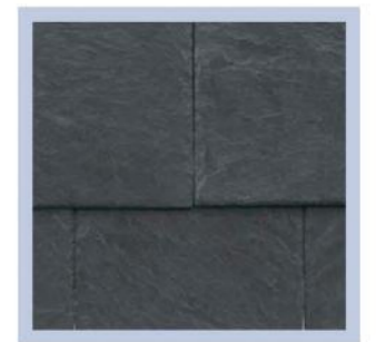
High Quality, Blue/Black, Natural Slate