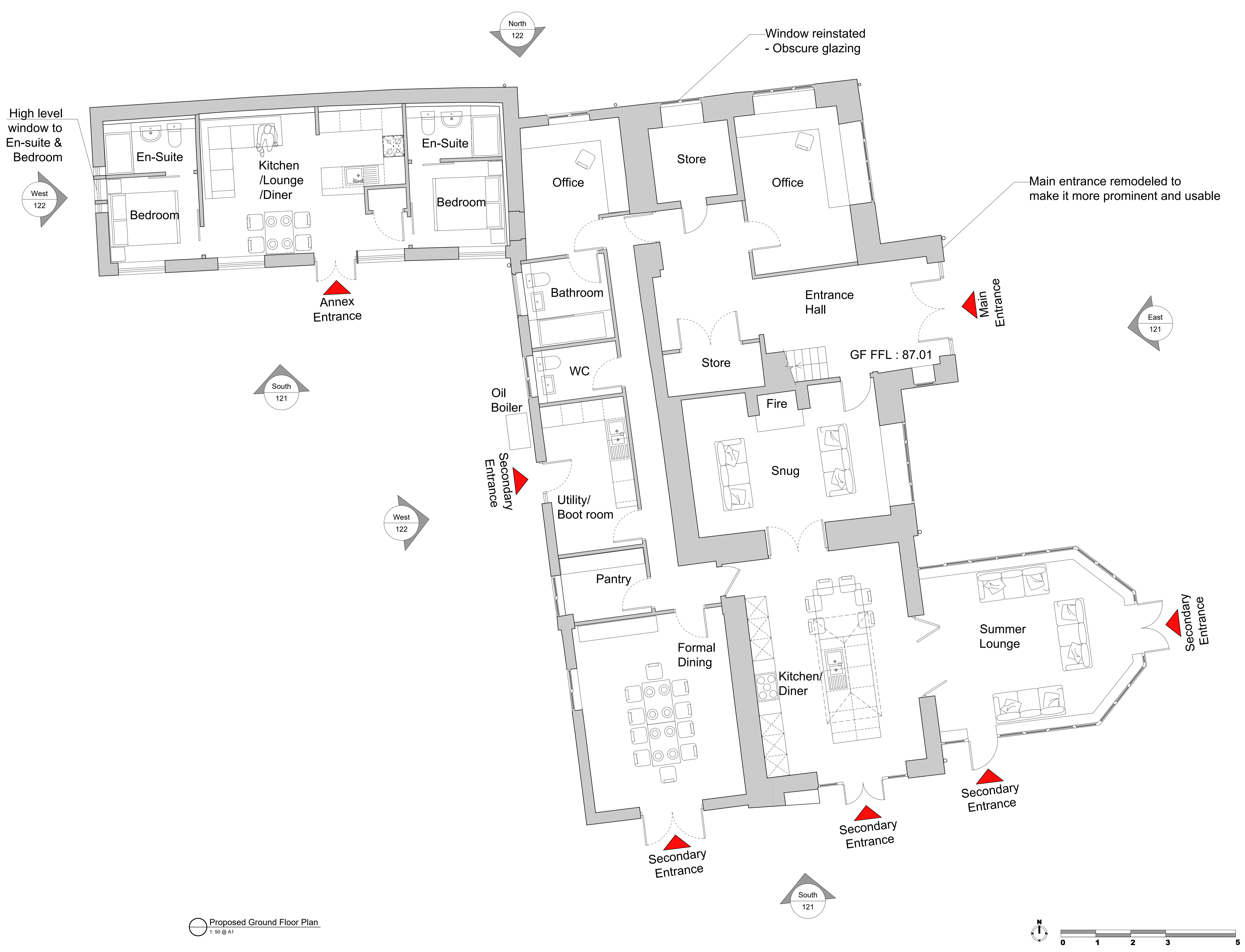
Proposed Ground Floor Plan 1:50 @ A1