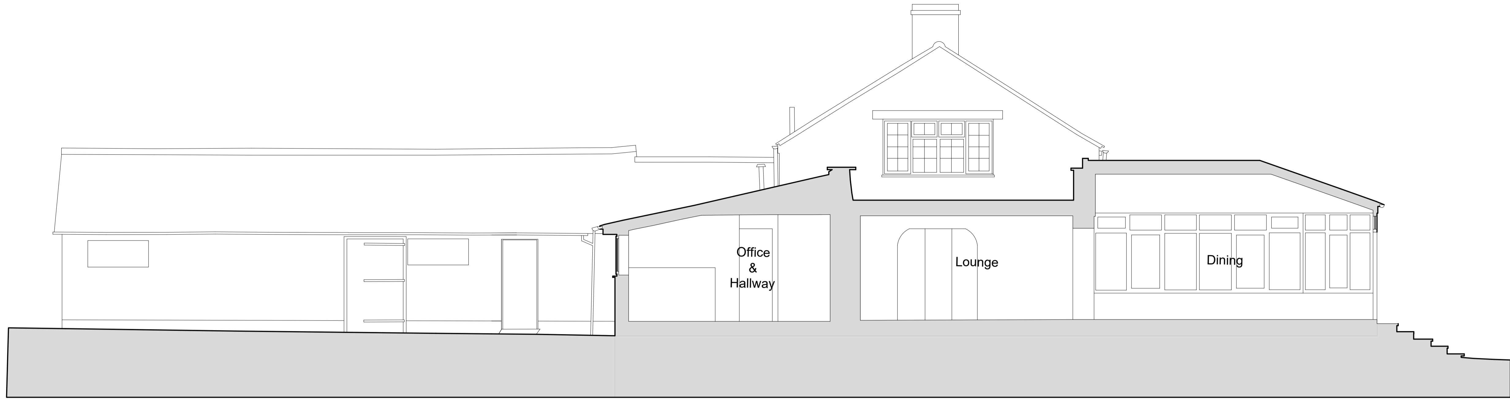
Existing Section AA 1:50 @ A1