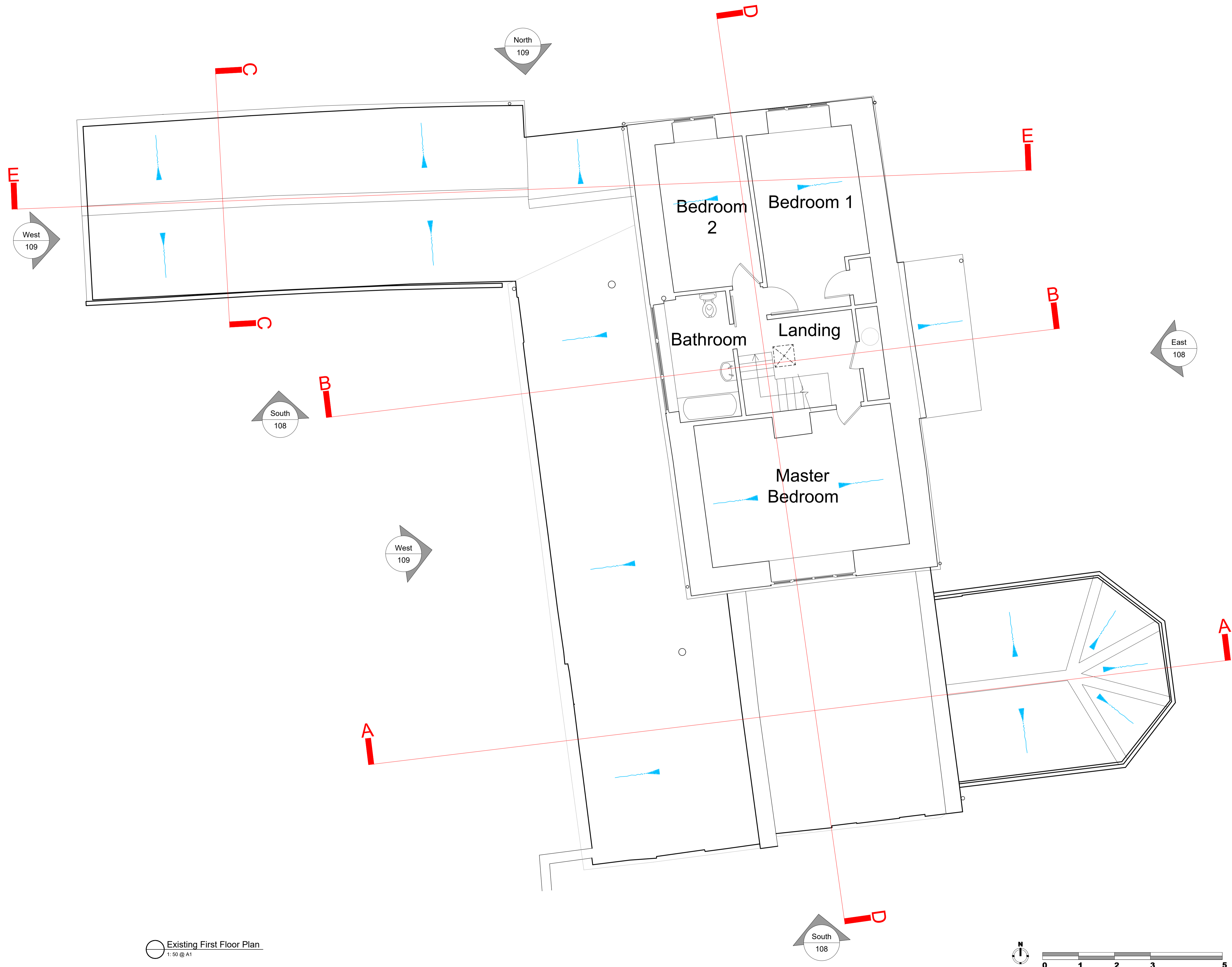
Existing First Floor Plan 1:50 @ A1