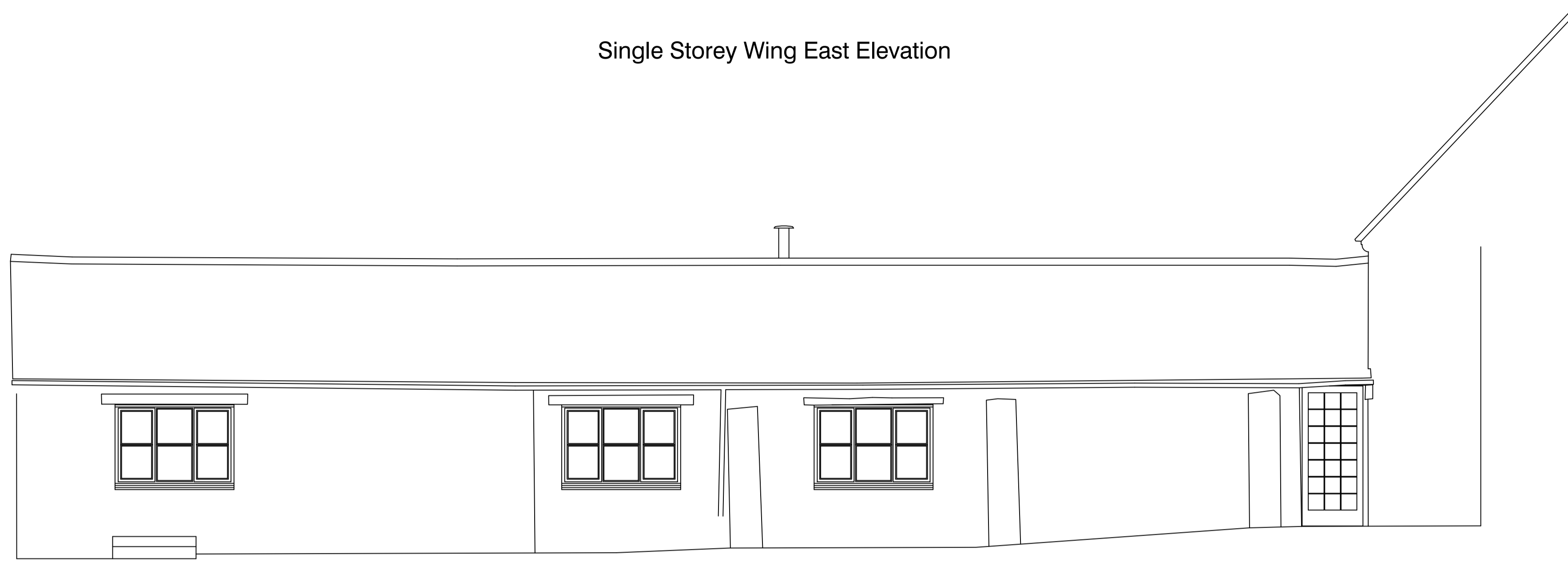
Single Storey Wing East Elevation