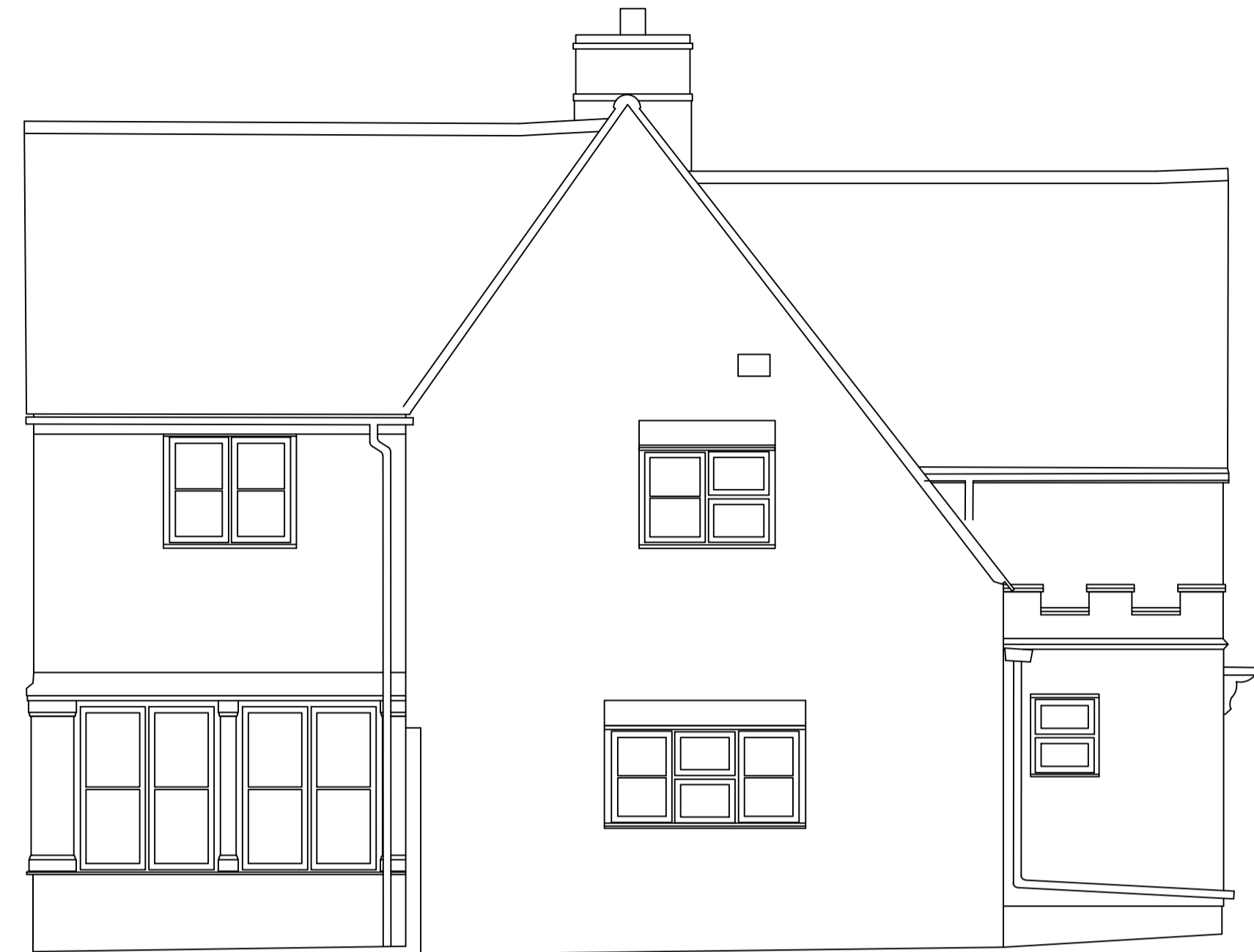
Main House East Elevation