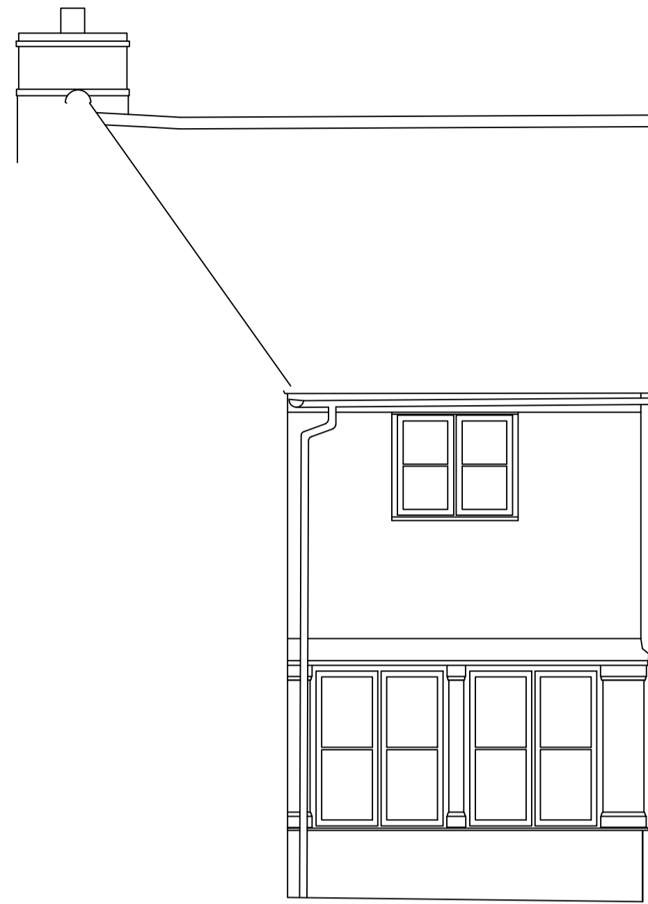
Main House Side Kitchen West Elevation