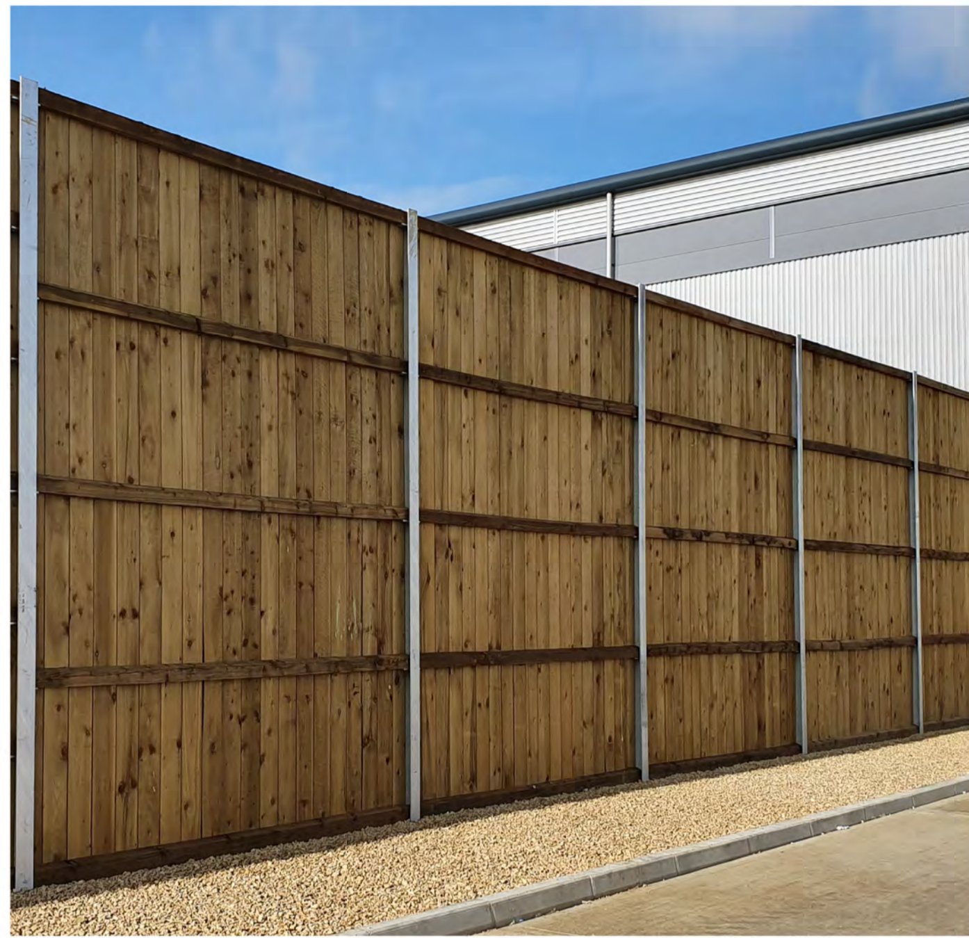
03 ACOUSTIC FENCING 029 typical rear elevation