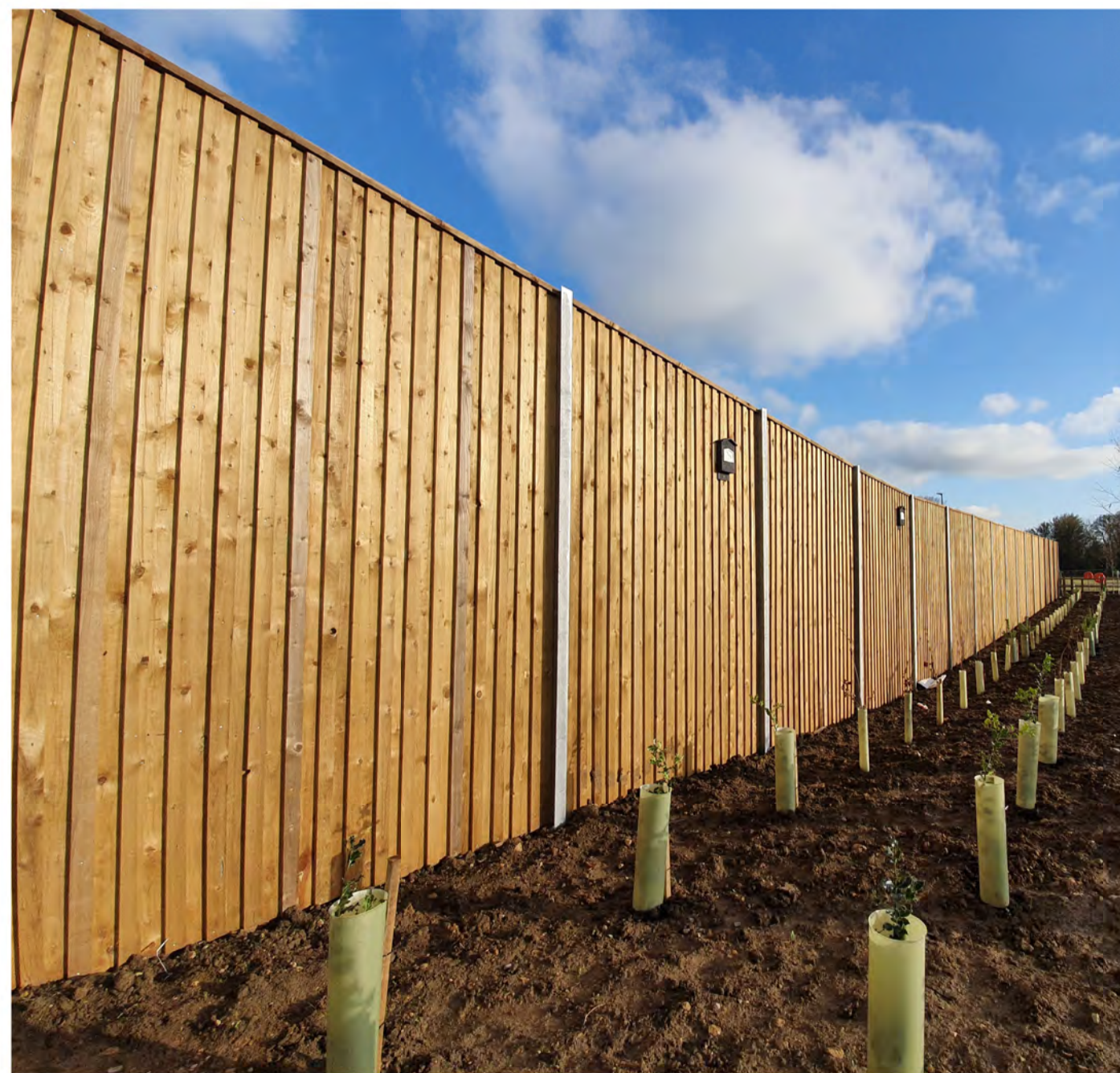
01 ACOUSTIC FENCING 029 typical front elevation