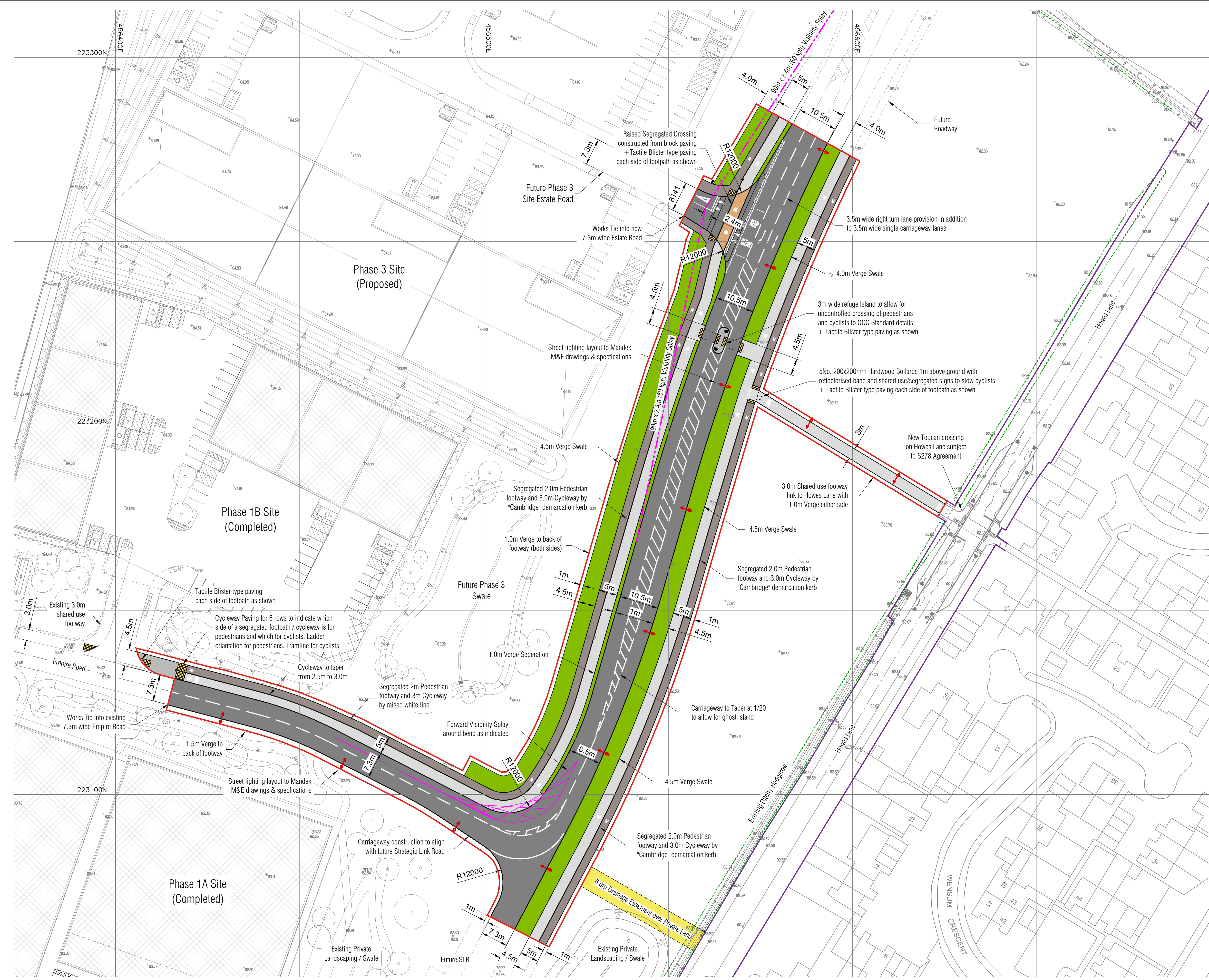
General Arrangement Plan 1:500