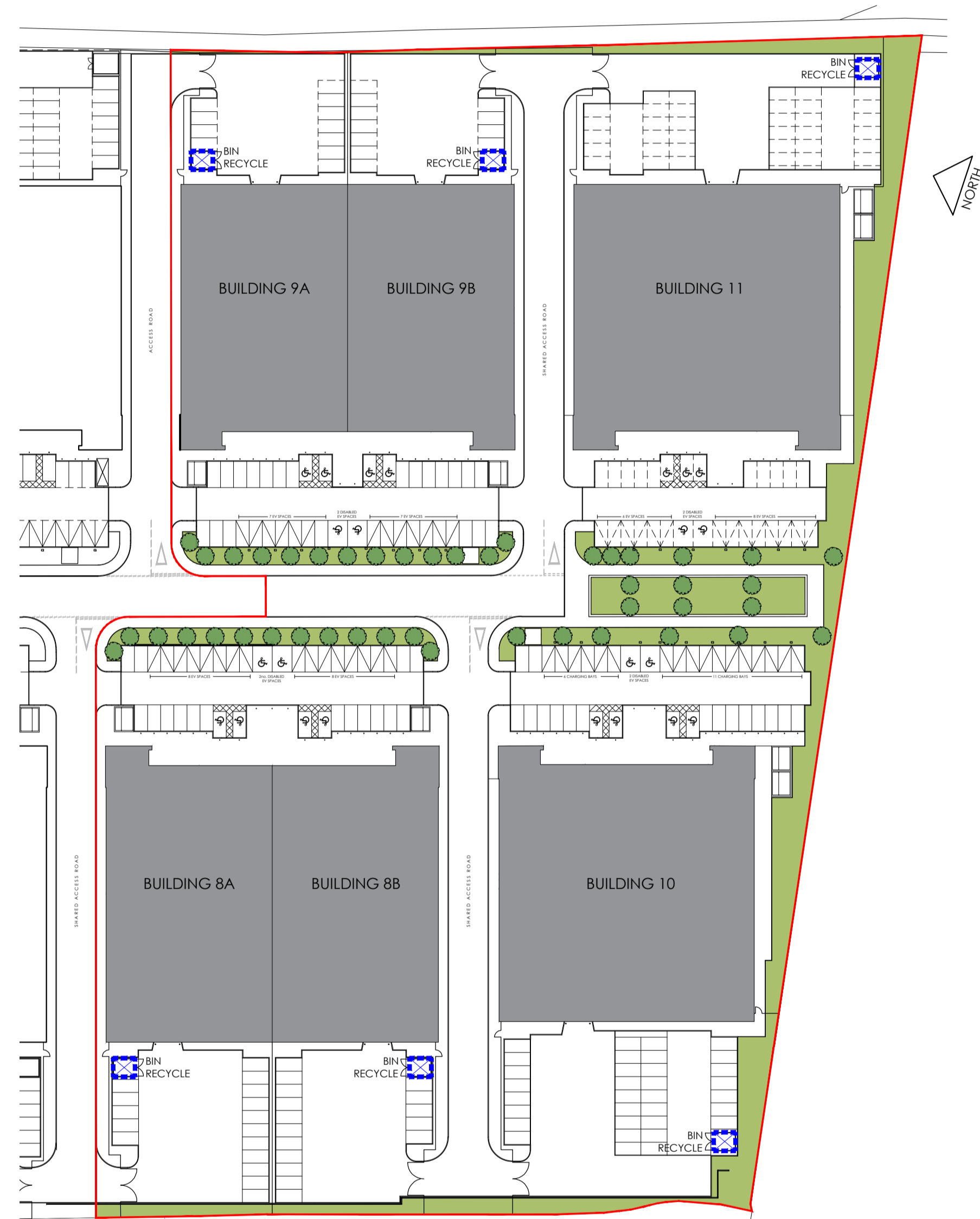
SITE PLAN DIAGRAM