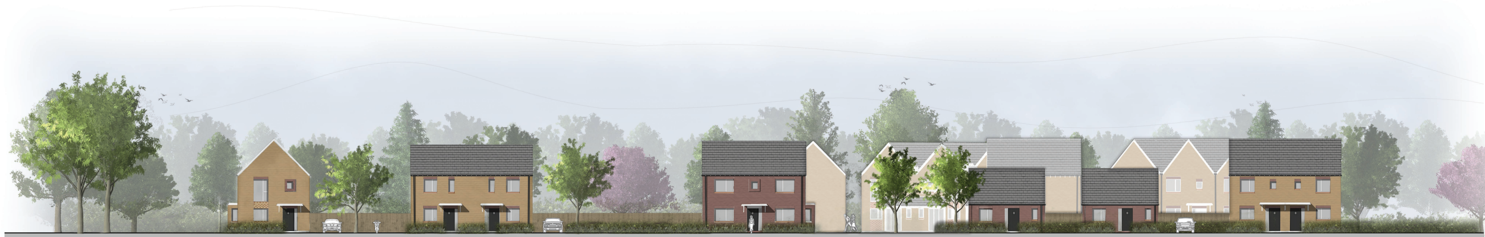
Plot 3 Plots 2, 1 Plot 34 Plot 49 Plot 48 Plots 47, 46