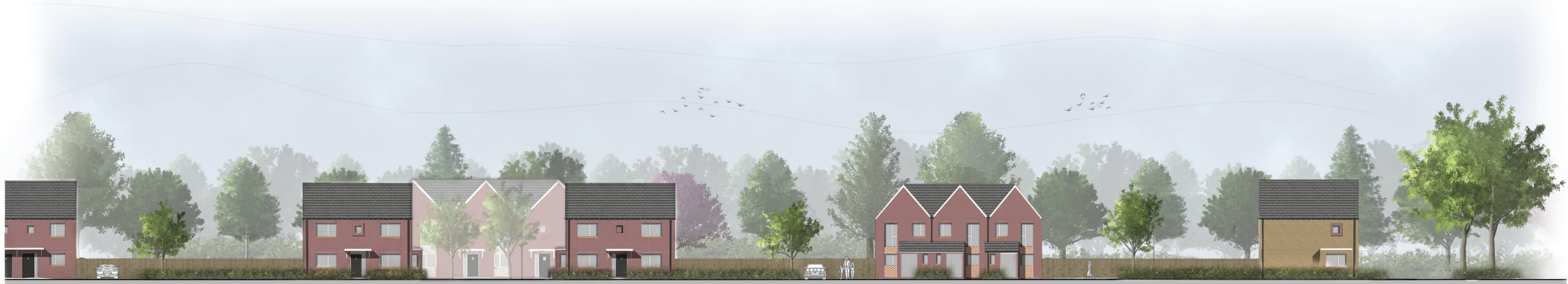
Plots 10, 9 Plot 8 Plot 7 Plots 6 - 4 Plot 3