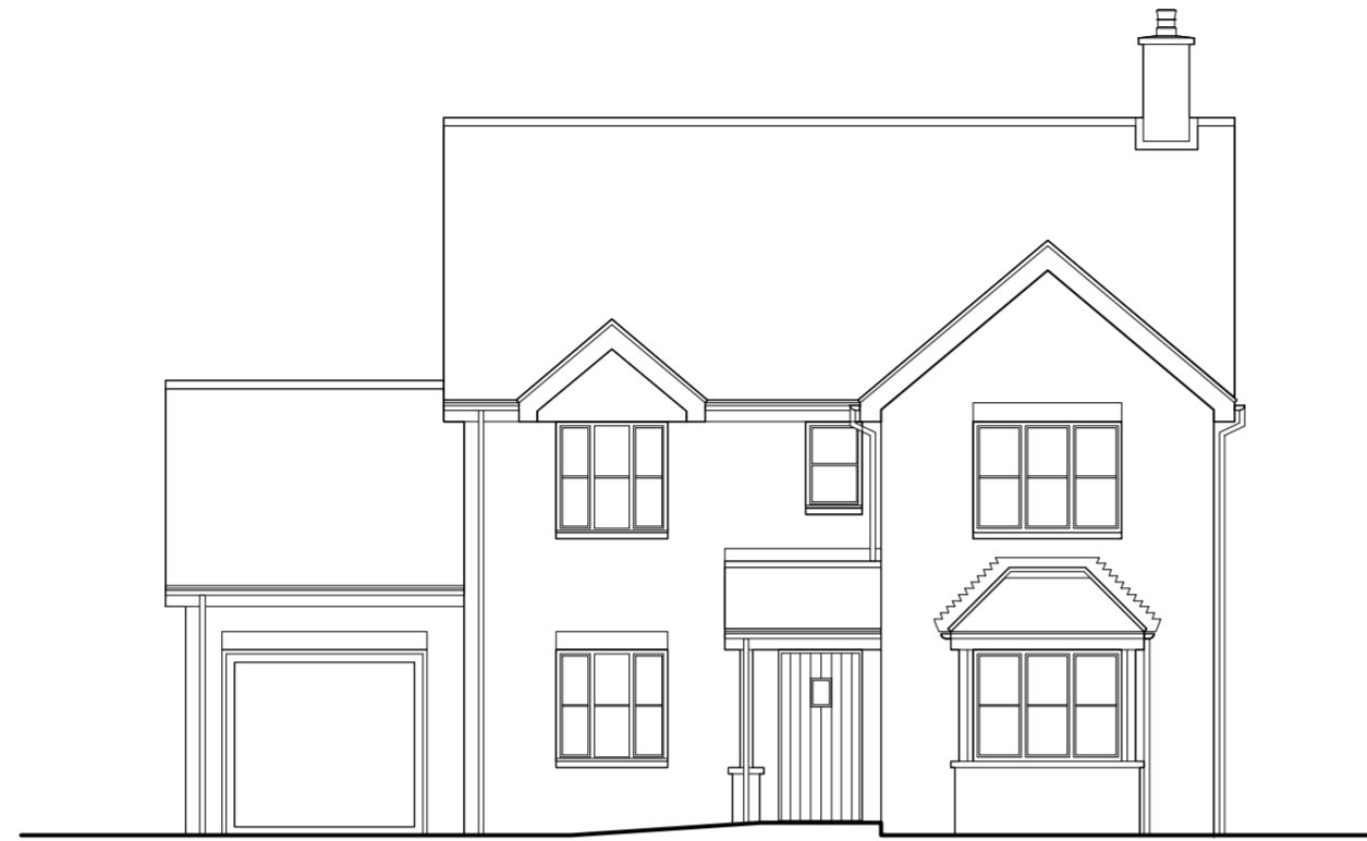
1 Existing SE Elevation 168-02 Scale - 1:100 @A2