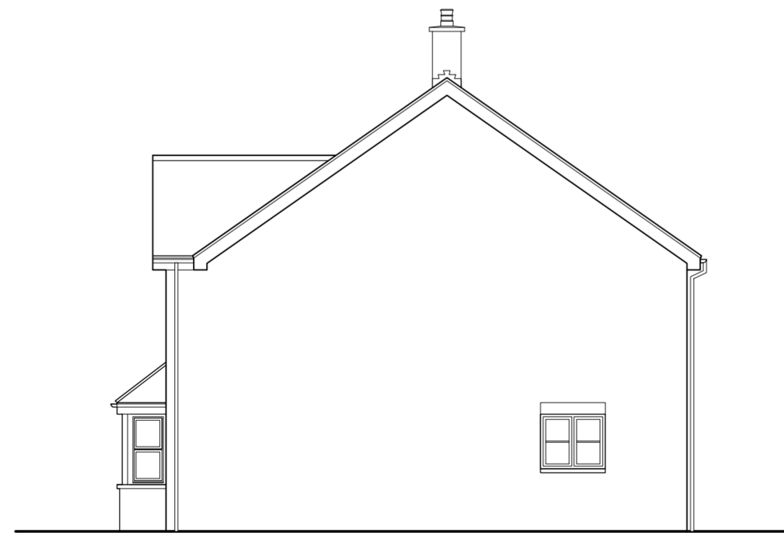
3 Existing NE Elevation 168-02 Scale - 1:100 @A2