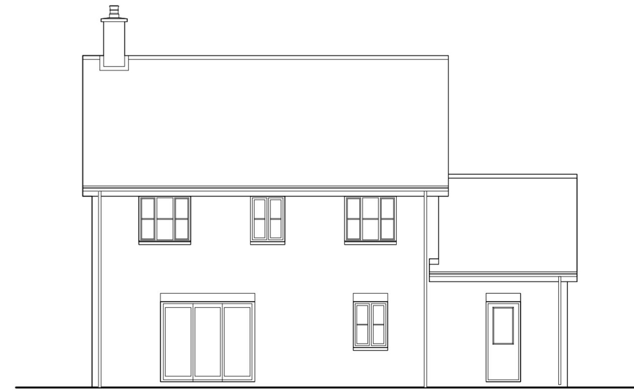
4 Existing NW Elevation 168-02 Scale - 1:100 @A2