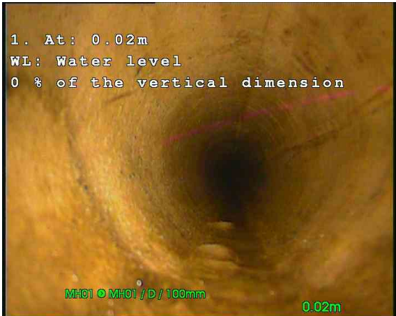
221114_1652A-Survey.jpg, 00:00:00, 0.04 m Water level, 0% of the vertical dimension