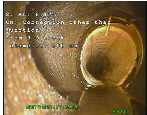
221114_1652B-Survey.jpg, 00:00:29, 6.19 m Connection other than junction, at 09 o'clock, diameter: 100 mm