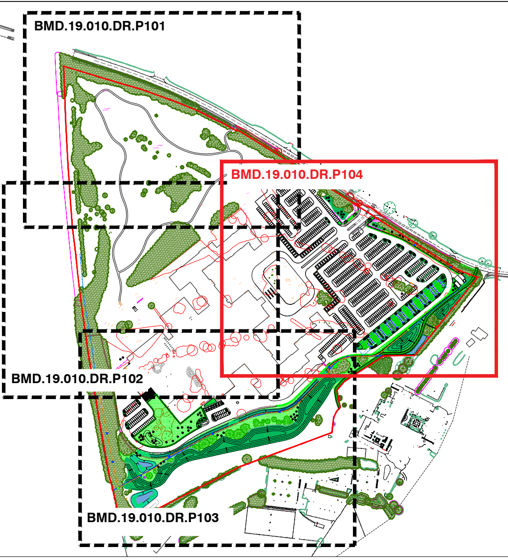
LOCATION PLAN 1:5000@A1