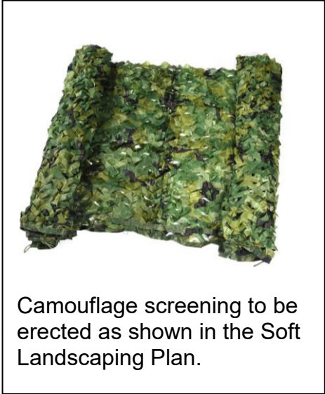
Camouflage screening to be erected as shown in the Soft Landscaping Plan.

Temporary Camouflage screening to be erected along the outside of the glass wall panels. This screening will be kept in place until the planting (as shown in the Soft Landscaping Plan) has grown to the height of the glass panels.