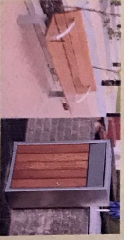
Proposed Westleigh Litter Bin (product ref. BX50S 2800) and Willenhall Seal (product ref. BX14 4015), as supplied by Broxap or similar.