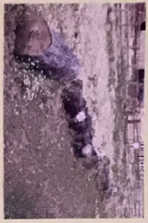
Proposed play logs. Providing balancing and nature play experiences.