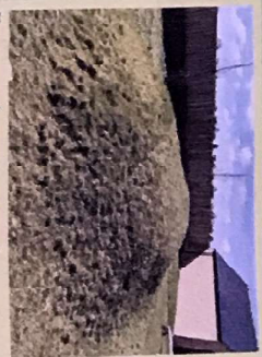
Proposed grass mounds. Providing nature play experiences.

Notes: All equipment, surfacing and structures to be installed in line with BS EN1176 and BS EN1177 and to receive a post installation ROSPA inspection prior to opening of facility. Entrance to have signage outlining no dogs allowed, the use of the facility, management responsibility and emergency contact details. Play equipment to be installed in line with suppliers recommendations. Any equipment with wooden posts in direct contact with the ground to have galvanised metal ground fixings. Equipment as supplied by: Kompan UK Ltd Shirwell Crescent, Furzton Lake, Milton Keynes, MK4 1GA Broxap Ltd Rowhurst Industrial Estate, Chesterton, Newcastle-under-Lyme ST5 6BP