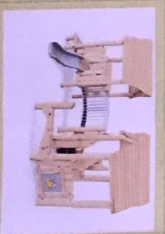
Proposed Little Beavers Stream (NRO2013 - Kompan). Providing balancing, sliding, climbing and social play experiences. Age range 1-6 years.