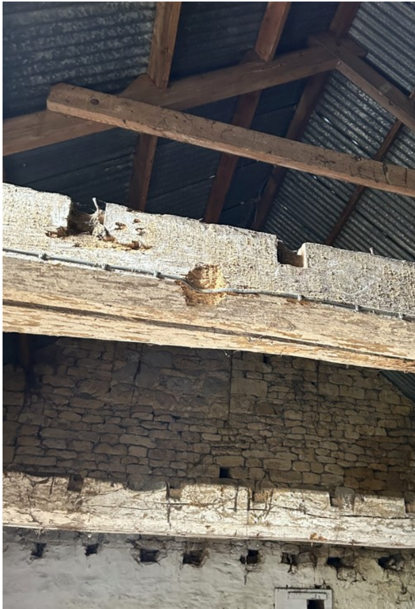
Fig.5 – North gable – former window opening

The presence of an original first floor is evidenced by the joist sockets in the remaining transverse beams. It would appear that the joists were removed later in C.20. The beams have been temporarily supported by strut framing to prevent collapse.