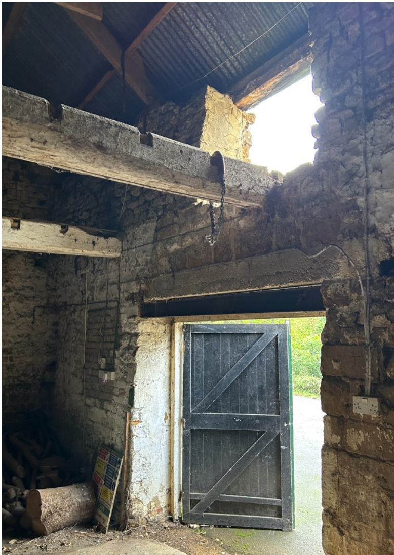
Fig.3 – Existing opening and floor beams