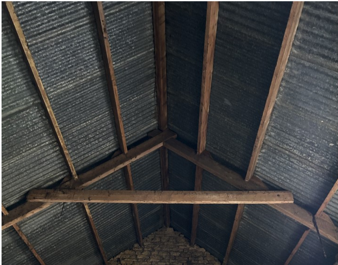
Fig.2 – Roof structure

It is apparent that the barn originally had a more steeply pitched roof springing from the existing eaves, the roof being originally thatched. The thatch would appear to have been removed together with the timber cracass and replaced with a corrugated steel sheet roof on a modern sawn timber frame with two intermediate, simple bolted trusses.