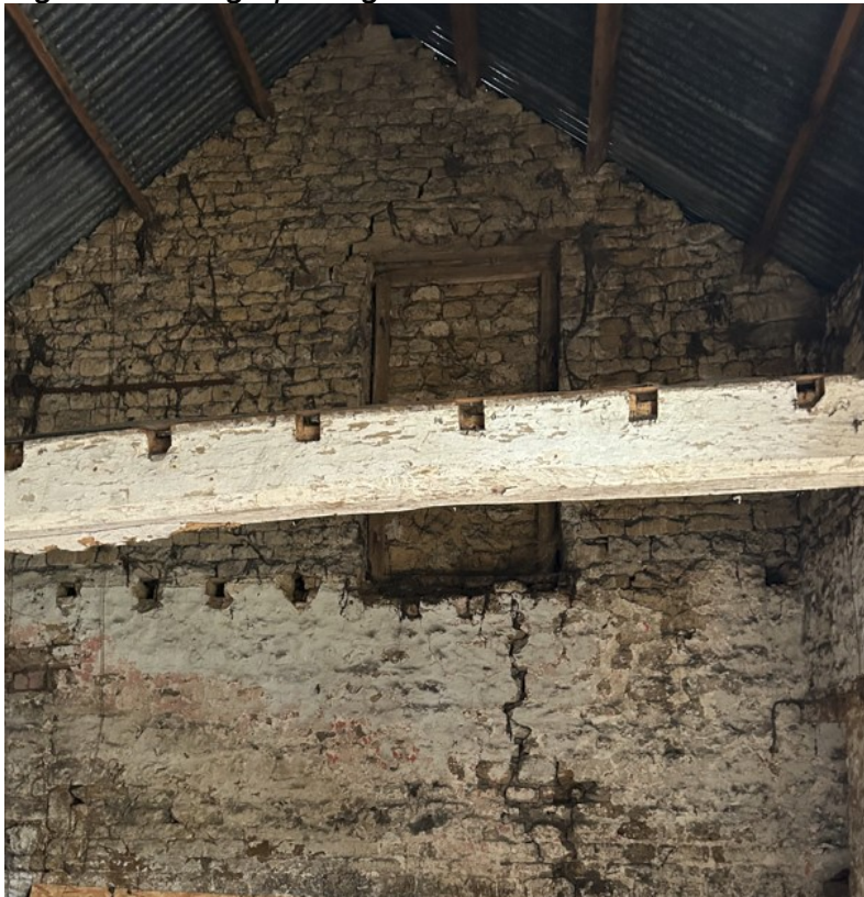
Fig.4 – South Gable - former window opening