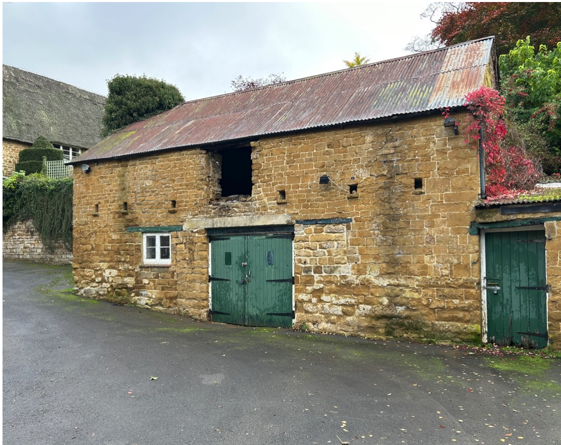
Fig.1 – West Elevation

The Listing Document records the North Arms to date from the late C.17. The outbuilding appears to be of a slightly later date: