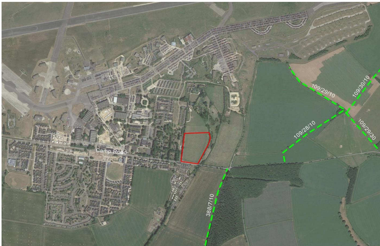
Figure 1: Site Context Plan

2.1.1. The site lies immediately to the east of the former Upper Heyford Air Base, approximately 5km to the north west of Bicester. The site currently comprises approximately 3.2ha of improved grassland which lies to the east of the former officer's housing. Camp Road defines the southern extent of the site, with a mobile home site located on the southern side of the road corridor. A localised watercourse defines the eastern boundary, separating the site from a larger arable field which lies to the west of Chilgrove Drive. Letchmere Farm and several paddocks lie to the north of the site and separate it from the former runway and associated buildings which are now used for a variety of commercial enterprises. The site is illustrated in its localised context on Figure 1 below. The localised context of the site has not materially changed since the 2017 ASA LVIA.