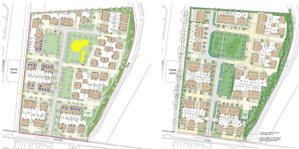
Figure 3: Proposed Site Plan Comparison – 2017 layout on the left, 2021 layout on the right