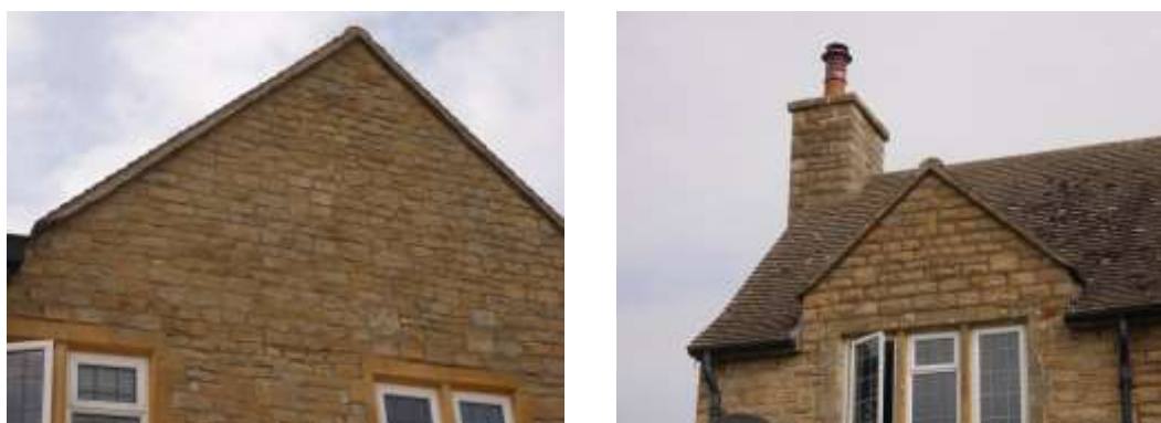
Figs. 9 & 10 Verge and chimney base fully pointed

The eaves were clipped and the chimney base was sealed to the tiles by cement with no cracks (Fig. 10).