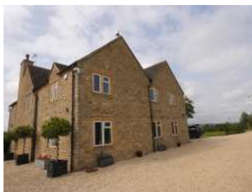
Figs. 1 & 2 House – south elevation (L) and west elevation (R)

The building was set within a formally landscaped garden, this consisting of a gravelled driveway and parking area, close mown lawns, a few scattered trees, ornamental hedgerow, and flower and shrub beds (Figs. 3 and 4).