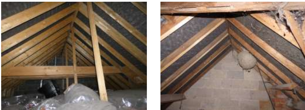
Fig. 13 & 14 Roof voids