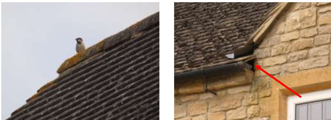
Figs. 15 & 16 Male House Sparrow (L) and nest site (R)

A pair of House Sparrows were nesting in a gap where the verge met the eaves (Figs. 15 and 16). This did not open into the roof void, so there was no internal bat access.