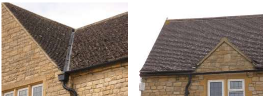
Figs. 5 & 6 Roof tight

The roof of the house comprised a series of interconnected pitched sections, these covered by clay tiles. All the tiles were tightly overlapping, with none raised, broken, dislodged or missing (Figs. 5 and 6).