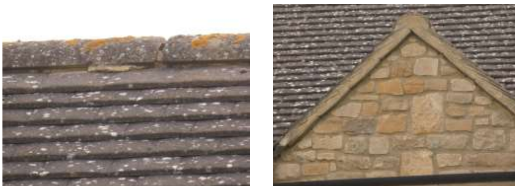
Figs. 7 & 8 Mortar crumbling at the ridge but verge fully pointed

Some mortar had dropped out from the bottom of the ridge tiles, but this did not create a gap leading under the ridge (Fig. 7). The roof verges were fully pointed with no gaps (Figs. 8 and 9).