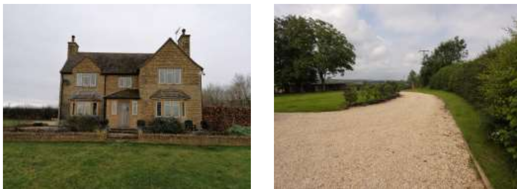
Figs. 3 & 4 Formally landscaped garden

The layout of the site is shown in the aerial photograph in Appendix 2.