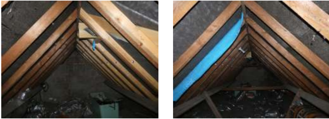
Figs. 11 & 12 Roof voids