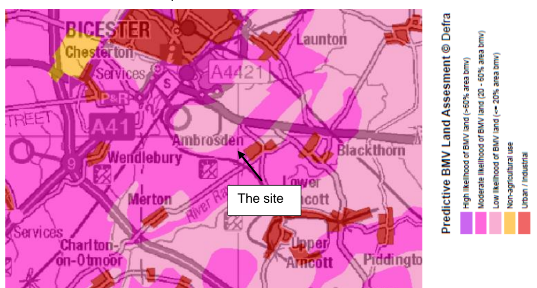
Insert 3: Predictive BMV Map

3.3 There is no publicly-available detailed ALC survey data for the site.