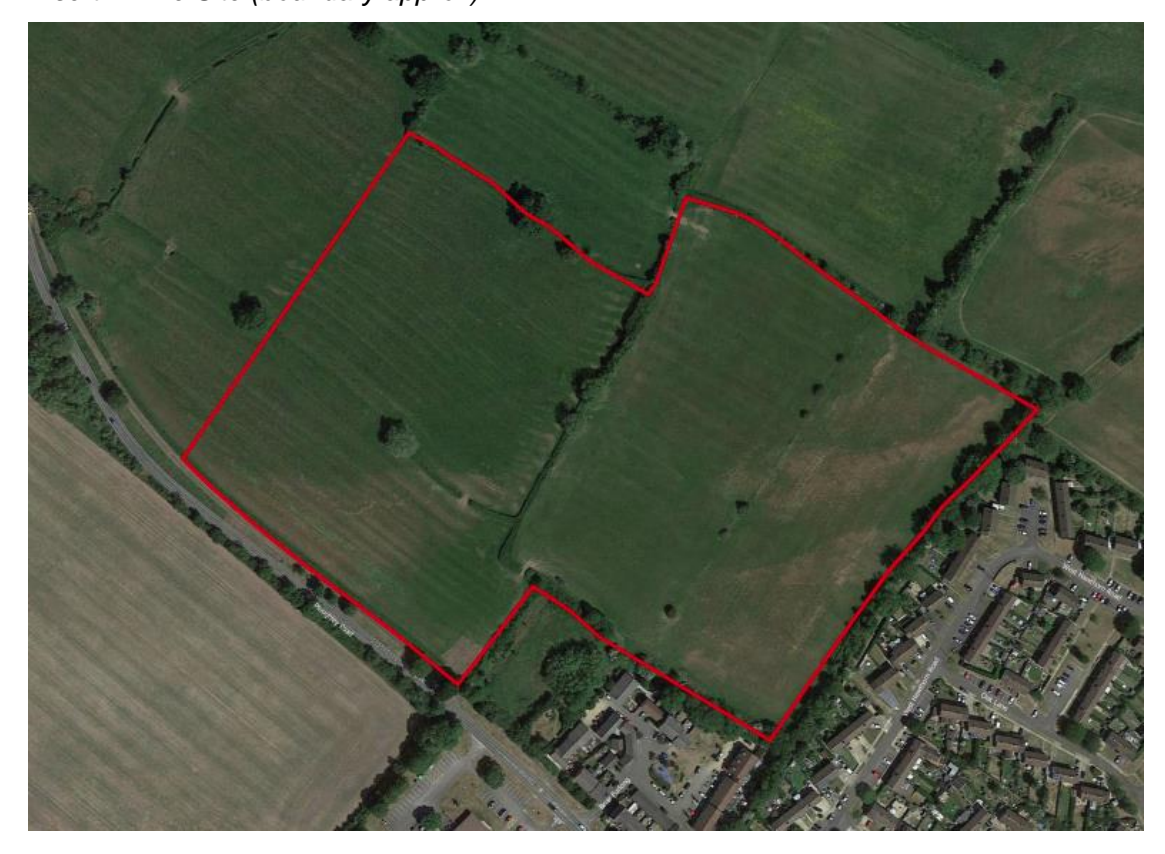
Insert 1: The Site (boundary approx)