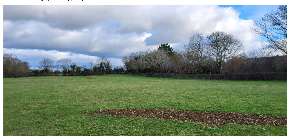
Plate 2: Stony (brashy) topsoil

Type 3. Type 3 occurs on the highest ground in the south-east, i.e., auger-bores 9 and 10. This land is underlain by limestone which gives rise to relatively shallow and brashy (stony) clay loam soils over weathered limestone at a depth of between 35cm-40cm. These soil profiles are well drained (Wetness Class I) but they are moderately droughty, i.e., shortfall of water available in the soil for optimal crop growth during the growing season. This grade according to soil droughtiness is Subgrade 3b (see 'interactive limitations' below). This type of soil accords with soils in the Elmton 3 Association (c.f. Elmton series).