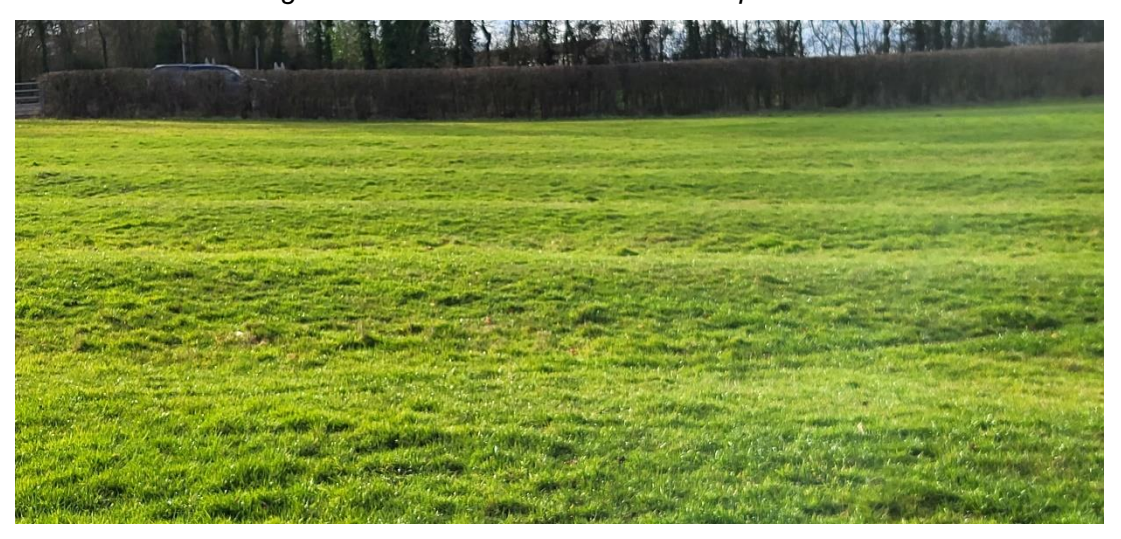
Plate 1: Prominent Ridge and Furrows in the north-western part of the Site

changes in slope angle and direction over short distances to Subgrade 3b. See Plate 1 below.