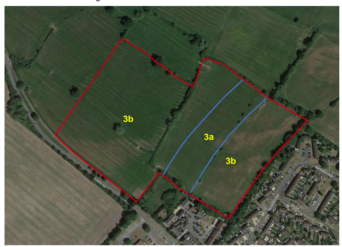
Insert 4: Location of Subgrade 3a