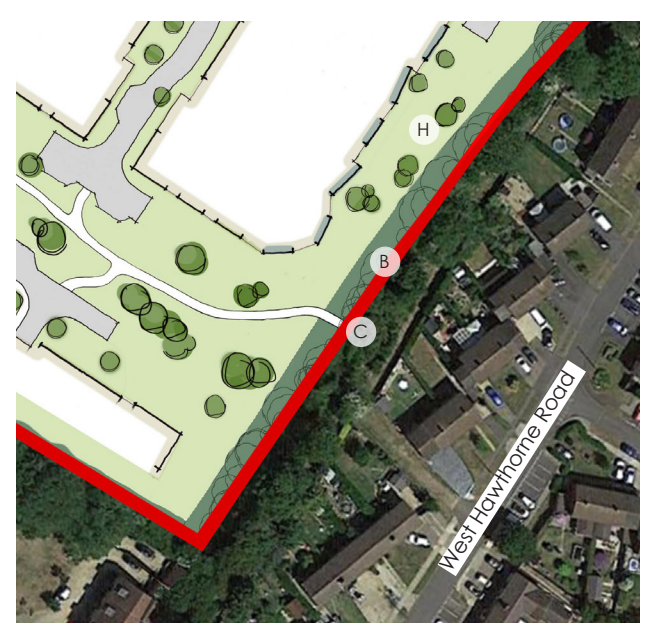
Updated Framework Plan FP-01A

In order to mitigate the impact of the pedestrian access on the existing boundary vegetation as described on Page 3, it is proposed that the pedestrian access point (C) is relocated approximately 15 metres north, as shown in the adjacent extract of the updated Framework Plan.